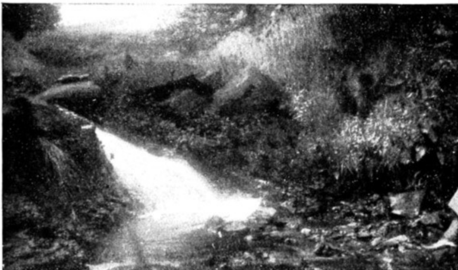
THE FALL OF WATER JUST ABOVE THE SITE OF LAST PHOTOGRAPH