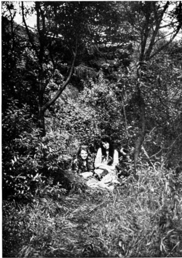
THE TWO GIRLS NEAR THE SPOT WHERE THE LEAPING FAIRY WAS TAKEN IN 1920

There are many people who have a recollection of these experiences of their youth, and try afterwards to explain them away on material grounds which do not seem adequate or reasonable. Thus in his excellent book on folk-lore, the Rev. S. Baring-Gould gives us a personal experience which illustrates several of the points already mentioned. "In the year 1838," he says, "when I was a small boy of four years old, we were driving to Montpelier on a hot summer day over the long straight road that traverses a pebble-and-rubble-strewn plain, on which grows nothing save a few aromatic herbs. I was sitting on the box with my father when, to my great surprise, I saw legions of dwarfs of about two feet high running along beside the horses; some sat laughing on the pole, some were scrambling up the harness to get on the backs of the horses. I remarked to my father what I saw, when he abruptly stopped the carriage and put me inside beside my mother, where, the conveyance being closed, I was out of the sun. The effect was that, little by little, the host of imps diminished in number till they disappeared altogether."