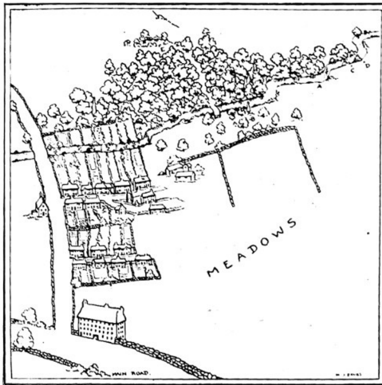
COTTINGLEY BECK AND GLEN

Sites of photographs are marked A, B, C, D, E, and the cottage with an X.