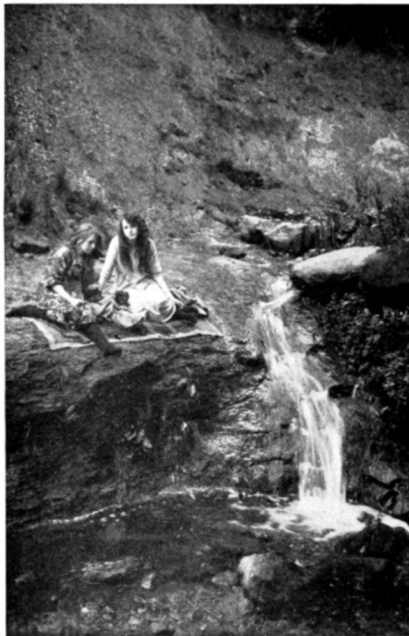
A VIEW OF THE BECK IN 1921