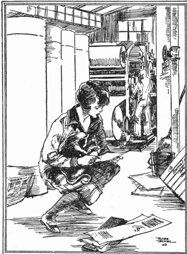
It was the story of the Charity Play.