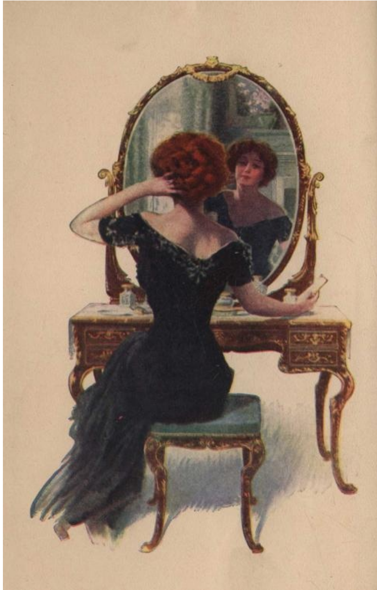
As she sat before her mirror...