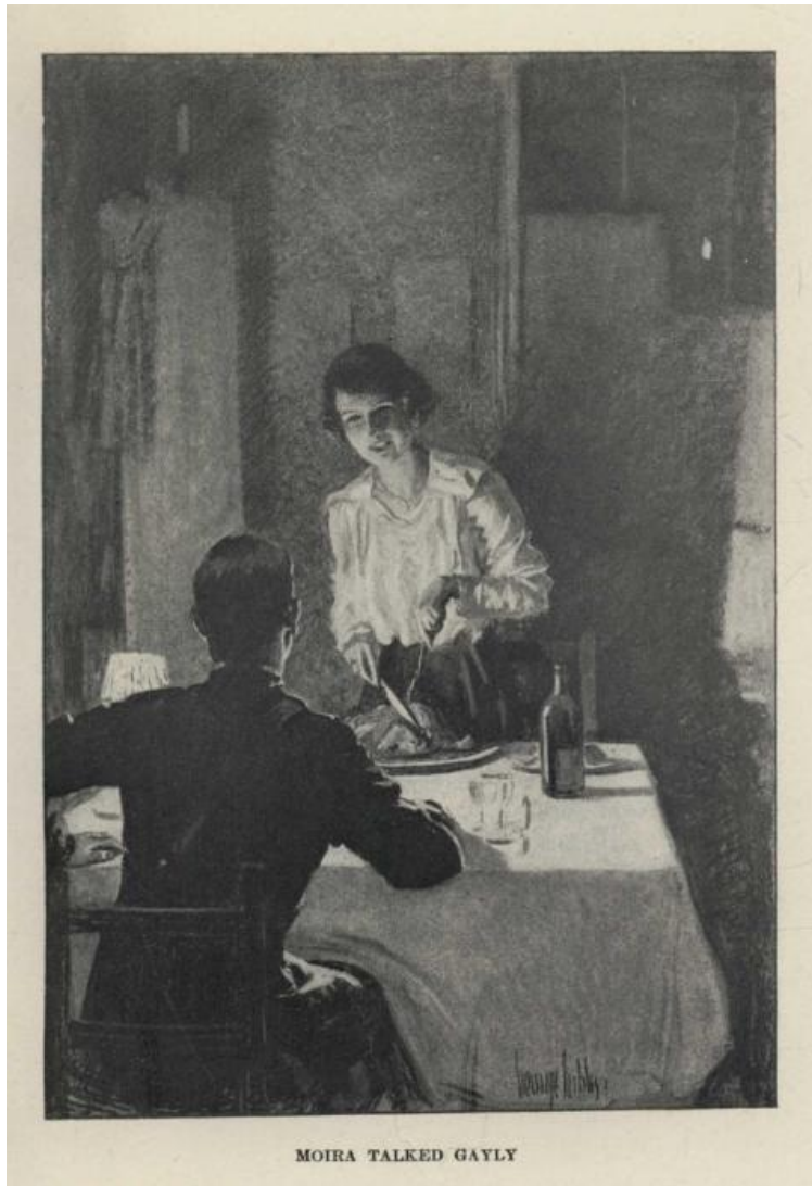
MOIRA TALKED GAYLY