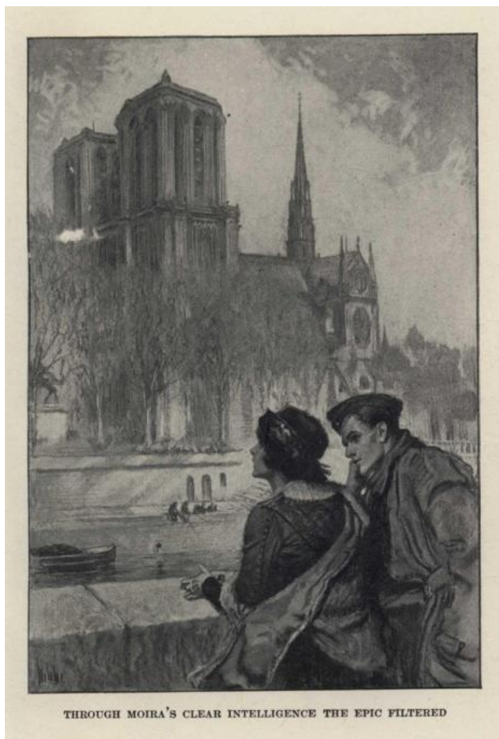
THROUGH MOIRA'S CLEAR INTELLIGENCE THE EPIC FILTERED