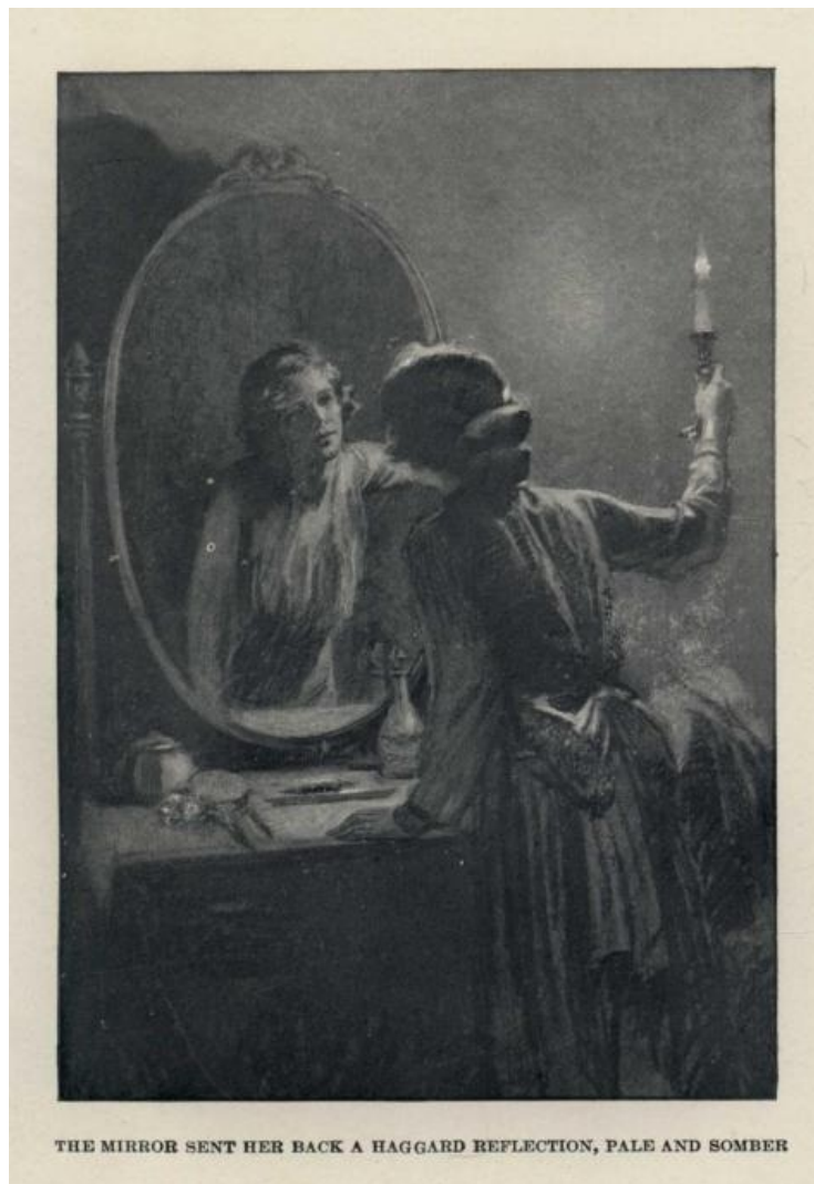
THE MIRROR SENT HER BACK A HAGGARD REFLECTION, PALE AND SOMBER