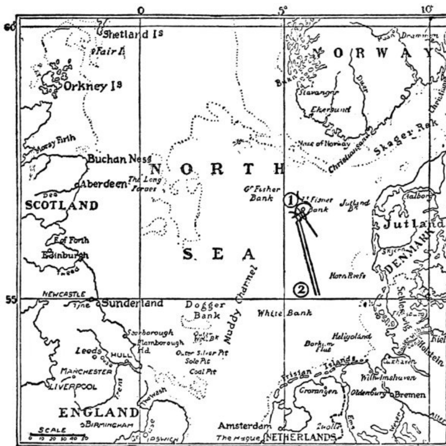
From A Guide to the Military History of The World War, 1914-1918 .

Chart showing the Battle of Jutland, in relation to the surroundings on the North Sea. (1) The Battle Field, May 31, 1916. (2) Position of British Fleet "at about 2.47 A.M.," (J) June 1, 1916. (This chart is diagrammatic only.)