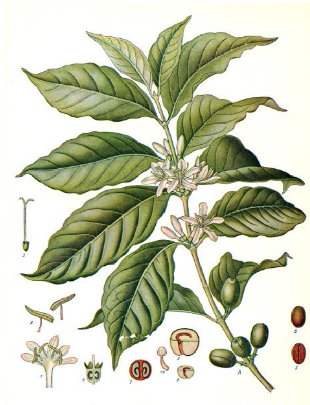
FROM K EHLER'S MEDICINAL- PFLANZEN. 5-99