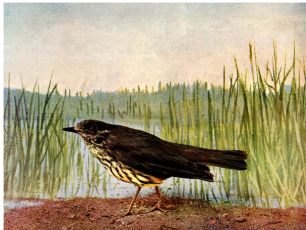
FROM COL. CHI. ACAD. SCIENCES. 5-99

If the hostility to the owls of the court house were to stop, if the caged birds were to be put back with their relatives, if the nocturnal gunners were to relent, would the remaining birds continue to add an interest to the public buildings by remaining there for the future as the guests of the town? Would the citizens of Doylestown, by degrees, become interested in the pathetic fact of the birds' presence, and grow proud of their remarkable choice of sanctuary, as Dutch towns are proud of their storks? To us, the answer to these questions, with its hope of enlightenment, seems to lie in the hands of the mothers, of the teachers of Sunday schools, and of the ministers.