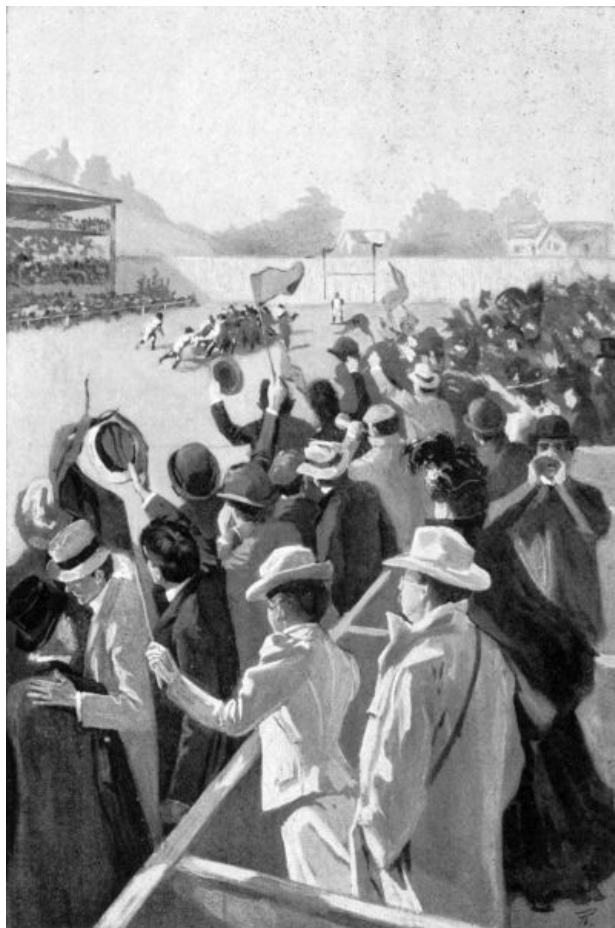
The charging players.