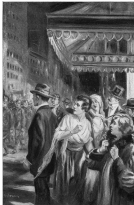
“ ‘In God’s name, what regiment’s that?’ ”

The soldier answered in good English with a touch of foreign accent.