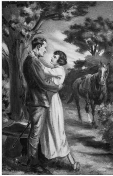
“ ‘It’s all love’s victory, dearest’ ”

He paused and turned to Zonia whispering softly: