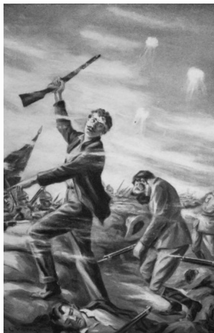
"Tommaso staggered to the breastworks and stood one man against an army"

She was still soothing their fears when Tommaso