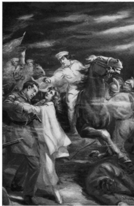
“Angela swept close ... fired and circled to fire again”

bravery, but the end was sure. They were outnumbered now, two to one. Their submarines stayed with superhuman courage and sent six battleships with five thousand of our bravest men to their graves before they went down.