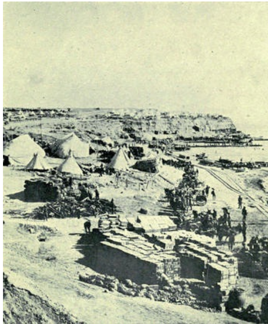
[To face p. 114.]

I WAS in India with my battery when the war broke out. I had been in the country for seven years, and much as I liked it—I thoroughly enjoyed my soldiering there—I wanted to be off to the front. But I was kept in India for six months, training men to fight the Germans, and so doing my bit in that way. Then I came to England, where my battery had a splendid time because the people were so kind; and after that very pleasant change I was off to the Dardanelles, and went right into a fair hell of fighting. You can imagine a lot as a soldier, but no flight of fancy would ever have made you picture in your mind the things that actually happened. It is all over now, and some of us in hospital have time to think of the brave fellows who are resting in the Peninsula. They could not do what they were set to do, because that was beyond the power of ordinary man; but they did more, I think, than any other troops in the world could have done. To any man who knows what the country and climate are like, and who saw the difficulties and endured the awful discomforts, it seems that almost miracles were performed; and of all the wonderful things none was more wonderful than the withdrawal from Gallipoli.