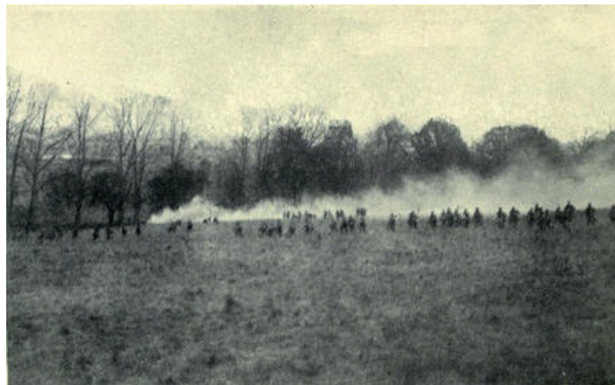
[To face p. 33.]

There are about 28,000 Britishers still in Germany, suffering as I suffered—some worse. They want releasing. The only way to release them is to end the war, and the only way to end the war is the cooperation of every man and woman, old and young, rich and poor, working for one object—VICTORY.