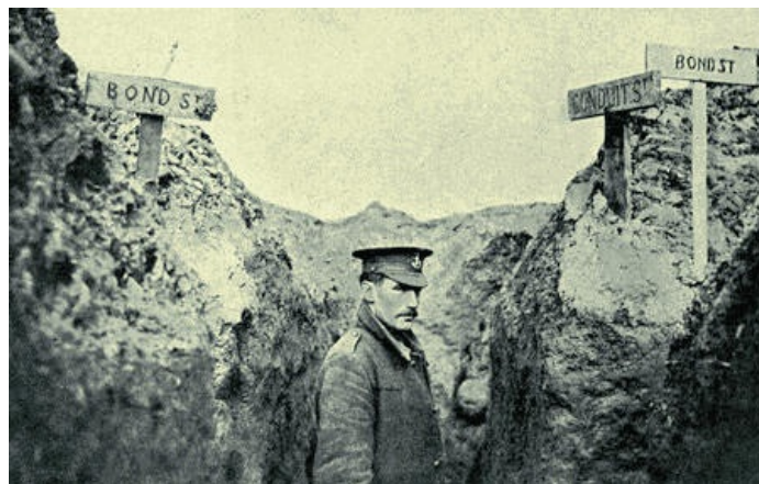
[To face p. 208.]

That was the beginning of my baptism of fire, and it was the most startling awakening I ever had. It was a stern warning, too, and we quickly retired to another reserve trench a short distance away and jumped pell-mell into it. There were some good goers that night, in spite of heavy ground and heavier equipment; but we soon recovered our composure when we were in the trench, and laughed and made the best of it.