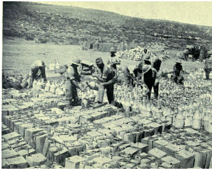
[To face p. 12.]