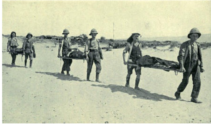
[To face p. 74.

they should not annoy him. I noticed that his boots were torn, and I took them off. I then saw that his legs had not been dressed—and he had been lying there for some time. I put iodine on the wounds.