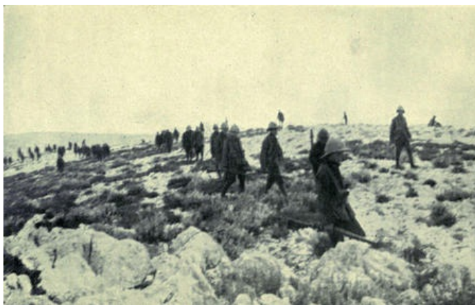
[To face p. 180.]

WE arrived at Lemnos on the evening of the 1st of May. The place itself is, so far as we can see, just a small island, amongst a lot of other islands, and is evidently a meeting-place for a heterogeneous collection of shipping—cruisers, colliers and cattle-boats. Trading, trawling and touting seem to be the several achievements of this mass. We are lying just inside ... the entrance of the harbour. All night the searchlights play across. Quite a little storm was caused by a small torpedo-boat "arresting" a collier with two shots from her biggest gun. Effective argument it proved. It seems she had not got her sailing papers in order. The defect was remedied.