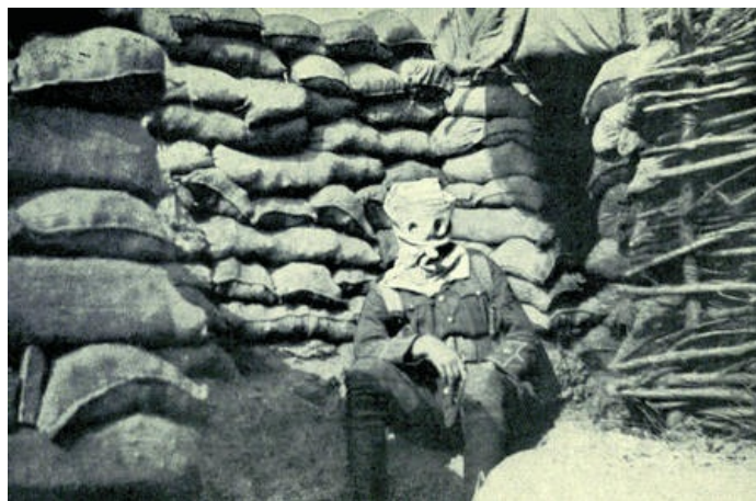
[To face p. 218.]

time from mine explosion till we were relieved at 2.30 p.m. Marvellous how we all escaped. I thought my number was up every minute, and my nerves were not of the best and I was feeling a bit rocky. While relief was being carried on we had an awful time: all kinds of shells, big and small, landing everywhere. Very fortunate to get out with no casualties. Incoming regiment had a few. At 11.15 p.m. I returned to trenches in order to go out again on patrol. Was out for thirty minutes, took survey and returned safely, covered with mud and pretty wet. Returned to — Farm, where my platoon is billeted. It is a small fortress, built up with sandbags from a big ruined brewery. Last night while asleep, about 3.30 a.m., a big shell burst just outside my cellar door, and again I thought my number was up. Earth, etc., was shot into my abode, and the doorway blocked up, not to mention bricks; but I was left intact.