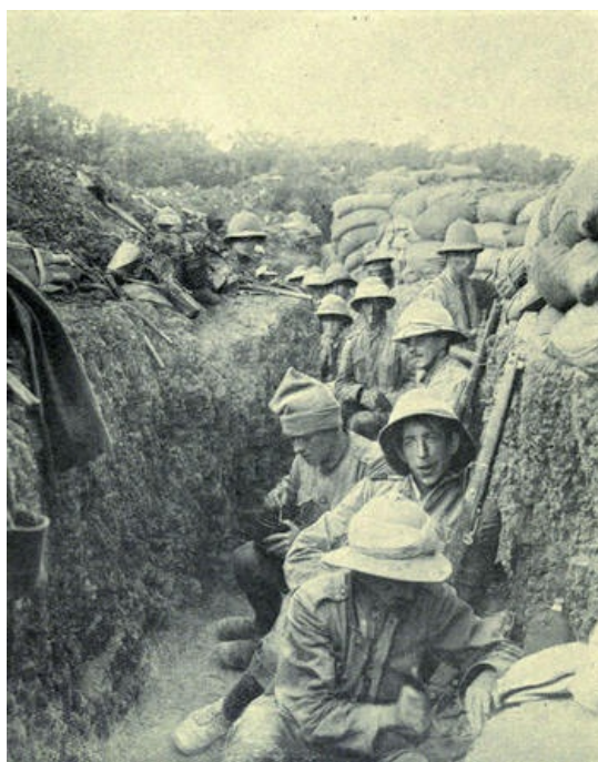
[To face p. 94.]

It is natural enough that I should take my mind back to a year ago. How clearly I recollect that morning when I had just finished breakfast and opened my newspaper, and to my astonishment saw that war had been declared and that all Reservists were to report at once, without waiting for the official notice from the depot.