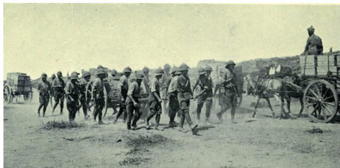
To face p. 62.

I WAS a sheep overseer when I joined the Australian Light Horse. Before that I was a jackaroo on a twenty-thousand acre station. What is a jackaroo? Well, a cross between a kangaroo and a wallaroo, and applied to a man, it means that he does anything that comes along. My boss’s station was twenty-five miles from the nearest town; but that’s nothing of a distance in Australia, and we used to have some merry parties when we had a day off, and drove or rode to the town for a change. And it was to the town that we swarmed just after the war broke out—bosses and men, rich and poor. A fine young fellow, a squatter’s son, Mr. David McCulloch, wrote and asked me to join the Light Horse, and I gladly did. He tried hard to come, too, but the doctor would not pass him, and to his intense disappointment he was rejected. He came to see me twice while I was training, and both times he tried to pass; but could not get through. That was the spirit which was shown when the call came out to us to go and fight the Germans and the Turks, or anybody else that British troops were up against.