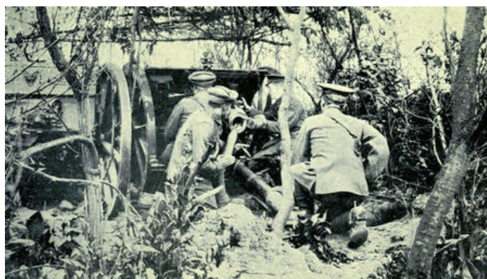
[To face p. 80.]

I was going along a street near an old ruined house which was being used as a soldiers' club, when I heard the noise of an exploding shell. The crash was very near, and soldiers rushed out from the ruined house to see what had happened. They told me that the shell had burst farther down the street, and that a civilian had been killed. Without any loss of time they took a door down, and using this as a stretcher they carried the dead man away, and as I watched them I realised that we were fairly in it, and I am bound to say that I was very strangely moved and deeply impressed by this little tragedy.