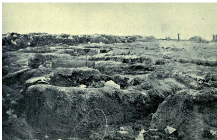
[To face p. 196.

I wanted to be a soldier, and the very day we declared war on Germany I enlisted in the South Staffordshire Regiment, the old 38th. I was trained hard for a few months; but that was easy work, because I had been employed in a Staffordshire forge. Then, before the Christmas of 1914 I was sent to France, and got a spell of trench work until March, when, on the 10th, the British captured Neuve Chapelle.