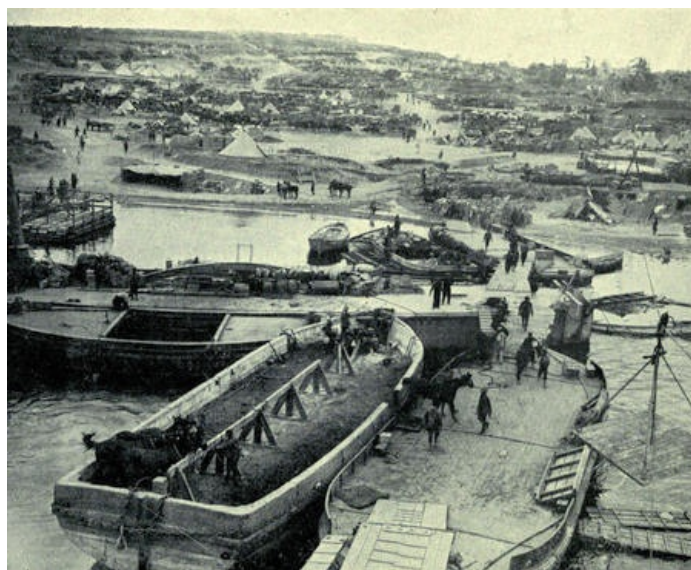
[To face p. 43.]