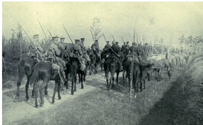
[To face p. 172.]

We were marching along when we discovered that these Uhlans had taken up a position commanding a road, and they had planted a Maxim, so that they could give us a warm welcome. They soon discovered that we were not going to be caught napping. Instead of keeping to the road we were promptly ordered to leave it and to take to a field running alongside. We made for the Uhlans as fast as we could go, but they did not stop to finish the welcome; they vanished, and I was unable to see the end of them; but it seems that they were completely surrounded and gathered in by some of our infantry.