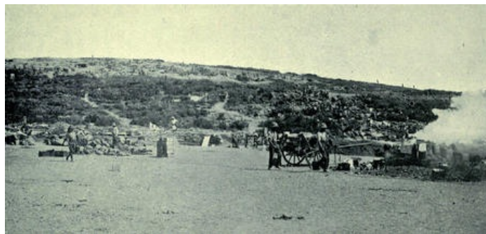
[To face p. 4.]

We were now in the thick of the awful country which I was to know so well. The surface was all sand and shrubs, and the great peculiarity of the shrubs was that they were very much like our holly trees at home, though the leaves were not so big, but far more prickly. These shrubs were about three feet high, and they were everywhere; but they did not provide any real cover. There were also immense numbers of long creepers and grass, and a lot of dust and dirt. The heat was fearful, so that you can easily understand how hard it was to get along when we were on the move. These obstacles proved disastrous to many of our chaps when they got into the zone of fire, for the shrapnel set the shrubs ablaze. This meant that many a brave fellow who was hit during the fighting on Hill 70 fell among the burning furze and was burned to death where he lay.