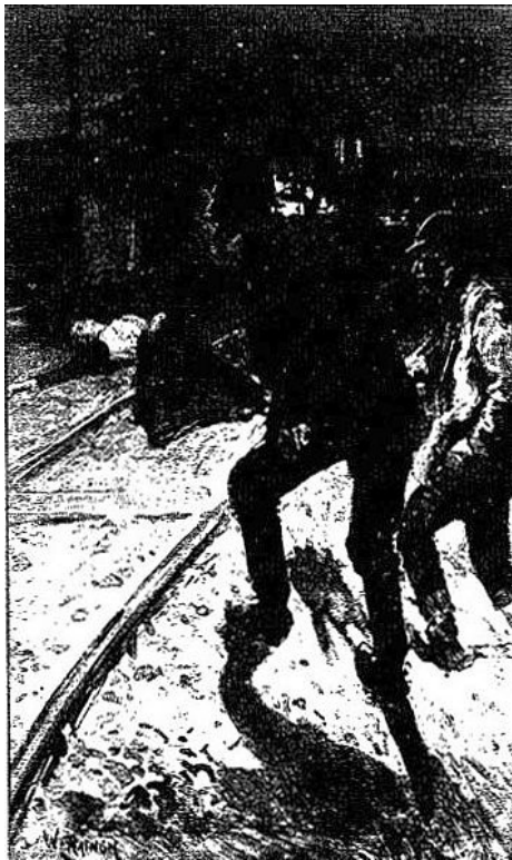
THE RESCUE-PARTY DISCOVER NELL ON THE RAILWAY TRACK

"Doctor wants to know if any one has seen Joey Trip, or his wife?" called another man, coming up at a run.