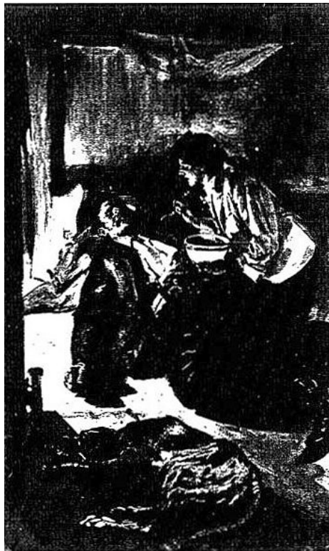
NELL NURSES THE STRANGER