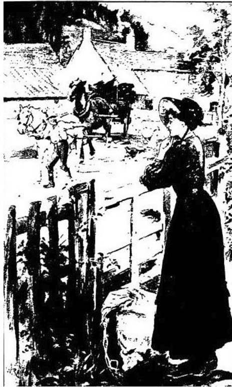
"COME RIGHT IN, WILL YOU, PLEASE, MISS?"

Her first move was to the window, which she opened as wide as it would go. Then she straightened the tumbled bedclothes, slipped a cool pillow under the sick woman's head, and gently sponged the hot face.