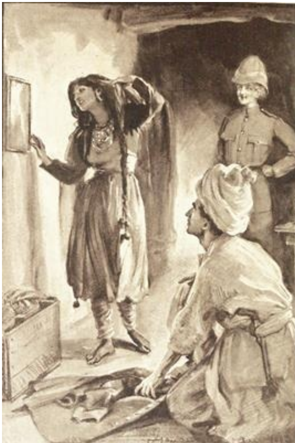
"SHE STOOD ADMIRING HERSELF FOR A LONG TIME"