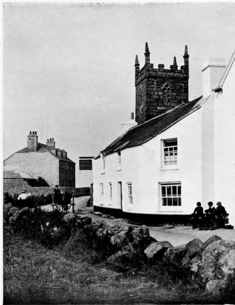
R. H. Preston & Sons.]

The men were smugglers and all asleep save the sentry, who lay near the edge of the cliff watching so eagerly for the expected boat that he had not heard the stoats' cry, though it sounded distinct above the roar of the sea.