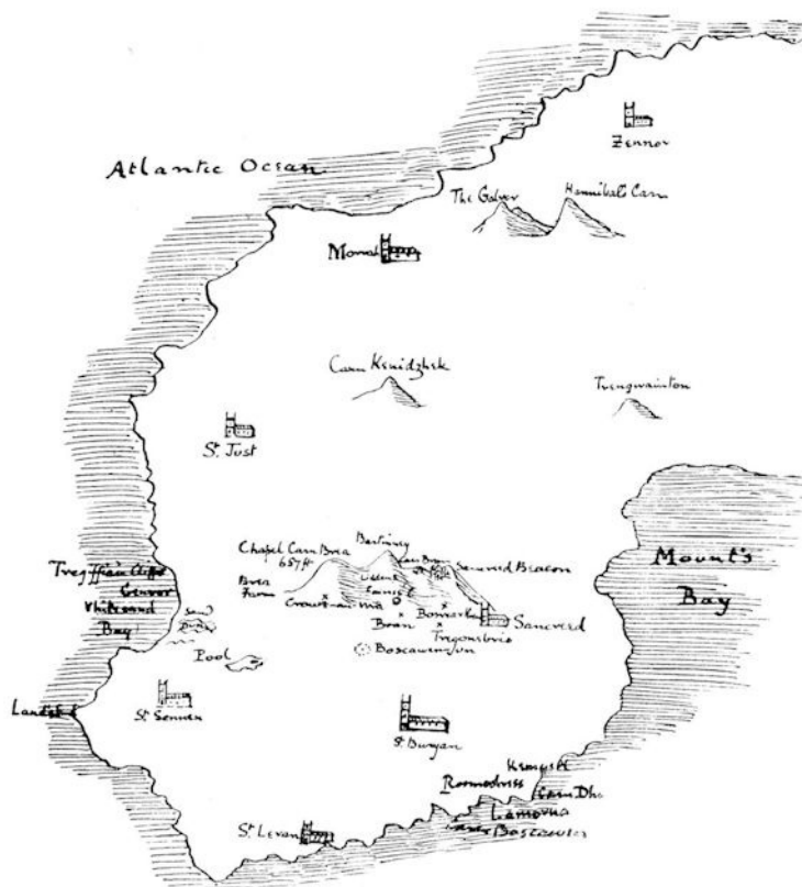
[To face p. 32.]

He disliked being punished, but did not mend his ways. Indeed he grew worse. A few nights later—it was Tuesday, because the Sennen men were at bell-practice—his mother all at once missed him and, going back, found him standing on his hind legs gazing at a scarecrow. The beaver-hatted object had excited his curiosity, and he was waiting to see it move. That was no great offence: before two hours had passed, however, the incorrigible fellow gave her the slip, and by making use of the “leaping” ruse she had taught him, prevented her from tracing him. She gave him up for lost; but the truant was happy enough, roaming amidst the barley or playing among the shadows cast by a stone-circle, confident in his knowledge of the country and his ability to find his way back to the hill. Yet he must have had misgivings or got scared, for he returned to the Carn at a very early hour; and there his mother found him looking sheepish enough after his spell of freedom. She had not sought him in order to rebuke him, for she had given up both complaining and correction; she had come solely to satisfy herself that he was safe. In a way she rejoiced in his independence, knowing that the time was fast approaching when he would have to fend for himself.