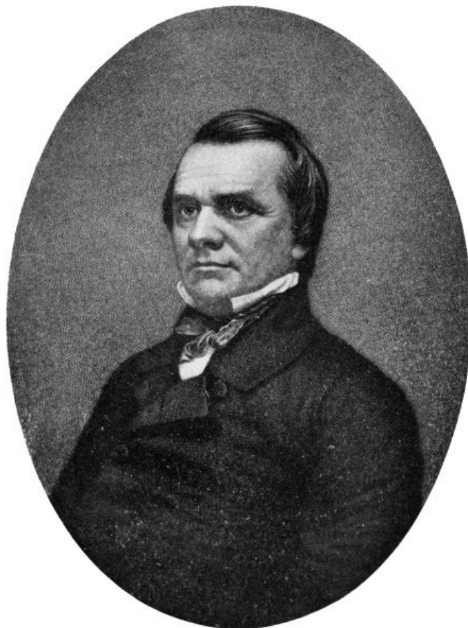
STEPHEN A. DOUGLAS

Senator Douglas died on the 3d of June, 1861.