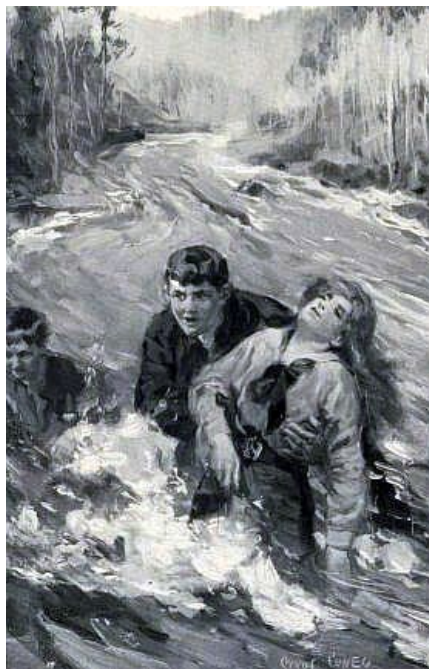
PAM WAS DRAGGED UP AND TUGGED HERE AND PULLED THERE

"Do you mean Mose Paget?" cried Jack, leaping to his feet with a startled air.