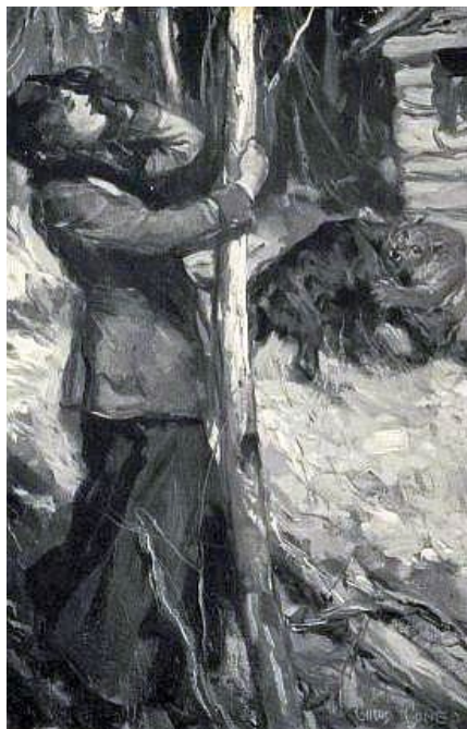
THE DOG AND THE UNKNOWN FURY WERE ROLLING OVER IN THE DEADLIEST OF COMBATS

It was not in her nature to give up, and so much hung on her ability to keep the place going through the winter. If her grandfather did not return in a year, and if he gave no sign of being alive, it was probable that the authorities would allow his death to be assumed. Then, in the event of no will being found, his daughter would naturally take what was left. It was the future of her mother and the other children that Pam was guarding, and she was minded to do her very best.