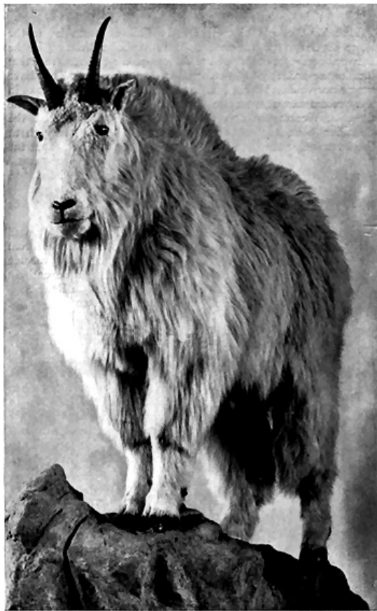
ROCKY MOUNTAIN GOAT

KILLED IN SPILLAMACHENE VALLEY, SOUTH OF GOLDEN, BRITISH COLUMBIA, NOVEMBER, 1903