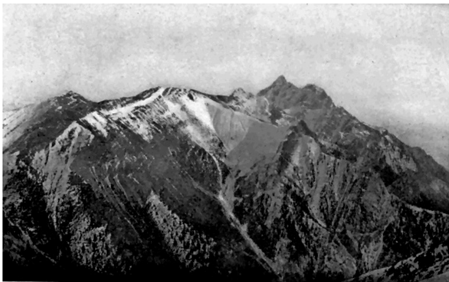
GOAT COUNTRY ON THE SUMMIT OF THE MAIN ROCKIES EAST OF THE MAIN ROCKIES, INDICATING CHARACTER OF COUNTRY WHERE GOAT, SHOWN ON PAGE 14, WAS SHOT.

The Rupicaprinæ comprise five widely scattered genera, extending from the Pyrenees of Spain, to the Rocky Mountains of the western United States, as enumerated below.