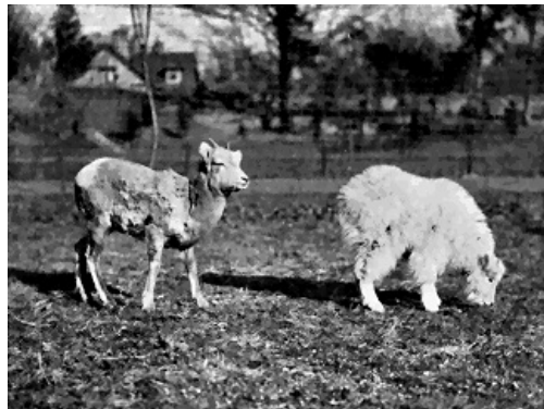
WHITE MOUNTAIN GOAT AND MOUNTAIN SHEEP

The animals south of the Canadian border and still in the main range of the Rockies, upon comparison with the preceding types, were found to be much smaller, in fact the smallest of all the subspecies and were characterized by shorter but still relatively narrow skulls. The specimens of this type under consideration having been killed in the Bitter Root Mountains, the subspecific name of O. m. missoulæ was given them by Dr. Allen. This is the fourth and last type to be described, although these animals from the Bitter Root Mountains were the first goat known to transcontinental explorers. This is the goat usually hunted by American sportsmen and its range probably extends from the southeastern limits of the genus in Montana and Idaho to the Canadian border, where like O. montanus it passes imperceptibly into O. m. columbianus . The extreme southerly limit of the goat in the Rockies is the Sawtooth Mountains and the Salmon River in Idaho. It does not reach the Tetons, in Wyoming, nor does it occur in the Yellowstone Park. The question of its absence in these localities will be discussed later in this paper.