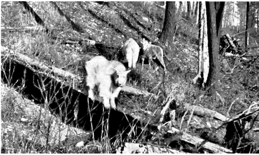
TWO GOAT KIDS AND MOUNTAIN SHEEP LAMB, BORN IN THE SPRING OF 1904 CAPTURED NEAR FORT STEELE, BRITISH COLUMBIA.

Now living and on exhibition in the New York Zoological Park.