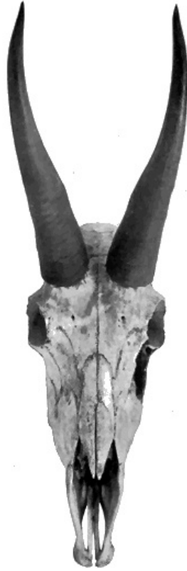
SKULL OF A GOAT

KILLED BY MADISON GRANT, SEPTEMBER, 1903.