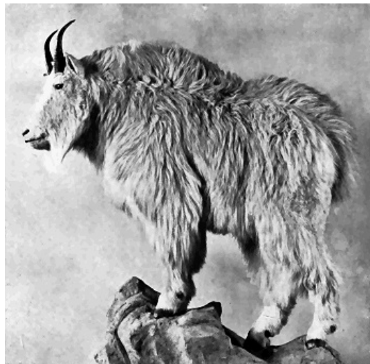
SIDE VIEW OF SPECIMEN SHOWN ON OPPOSITE PAGE.

In the midst of the distributional area of this large subspecies and in the vicinity of the Big Bend of the Columbia River, a very small goat is found. This animal, upon further investigation, may prove interesting. At present, however, all the Canadian goats must be provisionally assigned to O. m. columbianus .