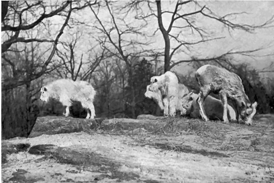
ROCKY MOUNTAIN GOAT AND SHEEP IN THE NEW YORK ZOOLOGICAL PARK.

Born in the spring of 1904, captured near Fort Steele and Michel, British Columbia.