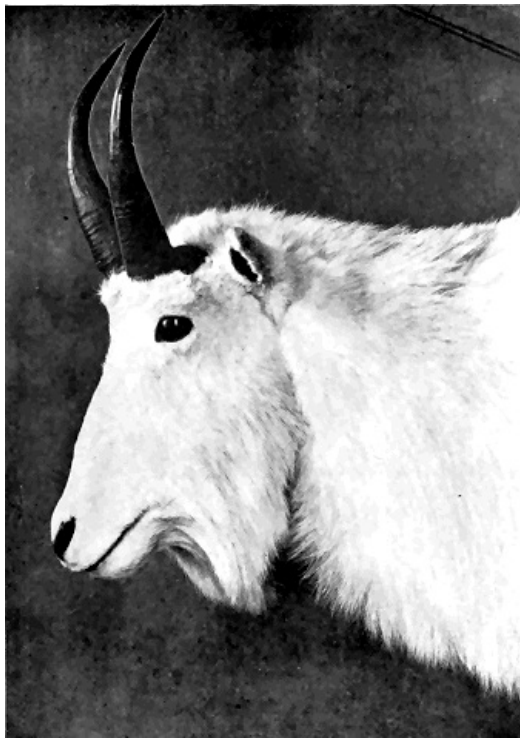
SIDE VIEW OF HEAD SHOWN ON THE OPPOSITE PAGE.