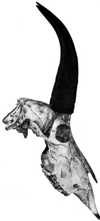
SIDE VIEW OF SKULL SHOWN ON THE OPPOSITE PAGE.