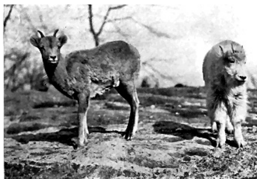
WHITE MOUNTAIN GOAT AND MOUNTAIN SHEEP