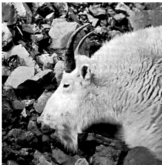
HEAD OF THE GOAT SHOWN ON THE OPPOSITE PAGE.