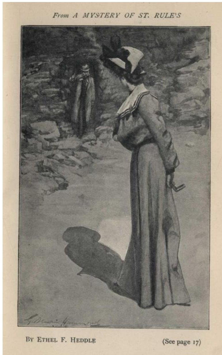
From A MYSTERY OF ST. RULE'S By ETHEL F. HEDDLE. (See page 17)