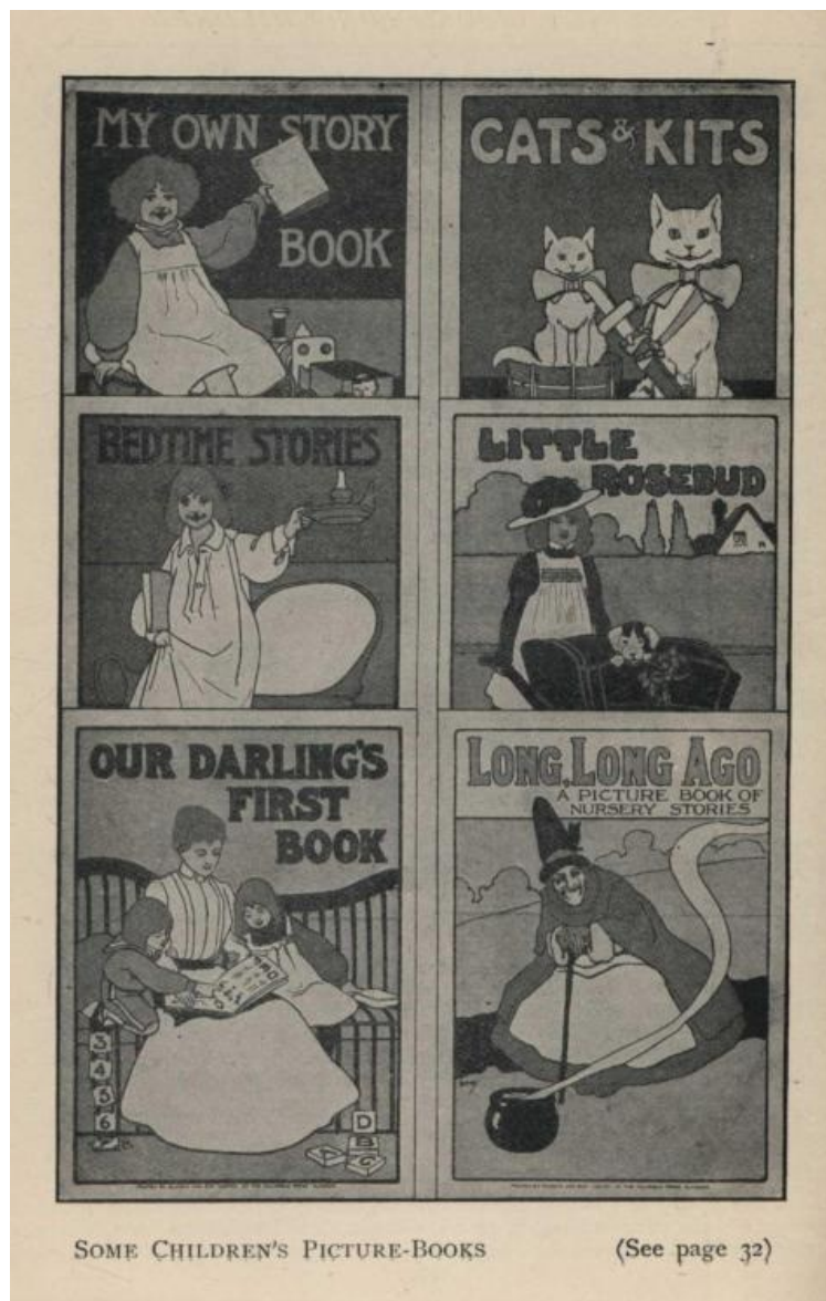
SOME CHILDREN'S PICTURE-BOOKS (See page 32)