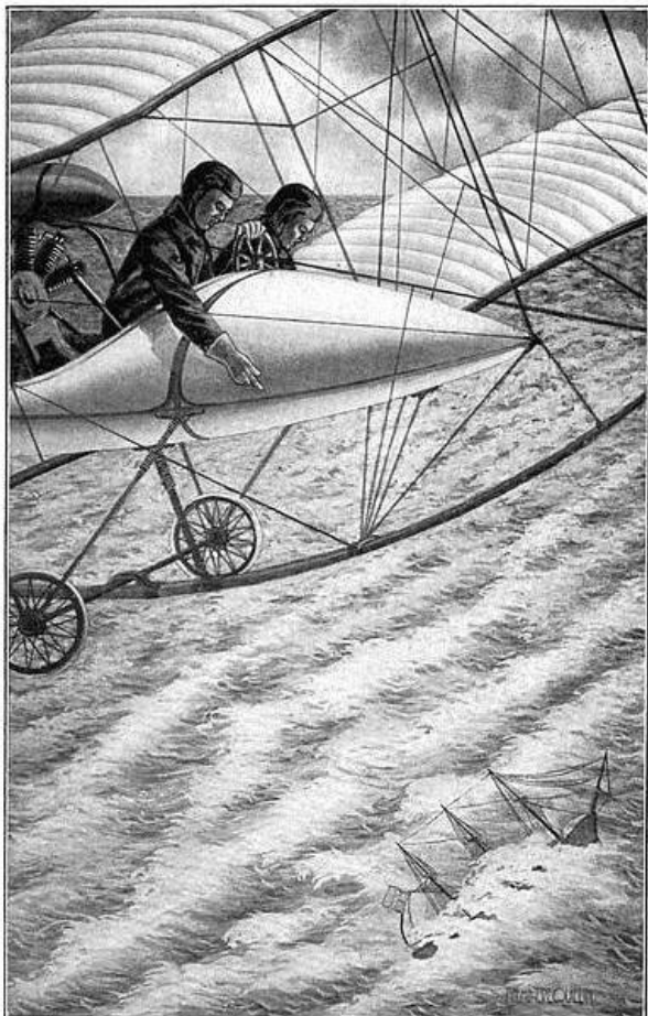
"THE YOUNG PILOT LESSENERD THE SPEED OF THE ARIEL." Dave Dashaway, Air Champion. Page 177.