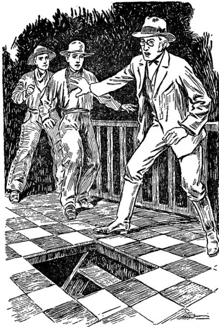
From the mouth of the dark pit a fetid, foul-smelling air rushed upward.