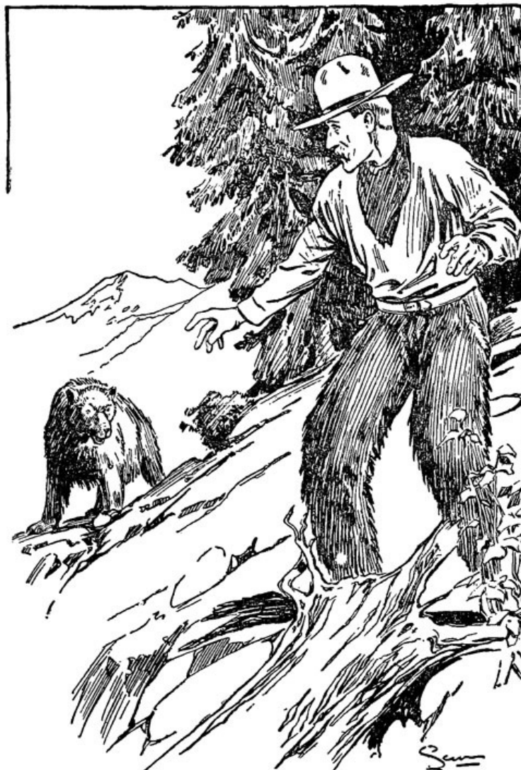
Standing at the opposite edge of the broken trail—not twenty feet from him—was a huge gaunt grizzly.

As it gazed upon the prey on which it had lumbered so unexpectedly, the horrible brute's little pig eyes blazed malevolently, and its huge fangs began to drip as if in anticipation of the feast to come. [211] [212]