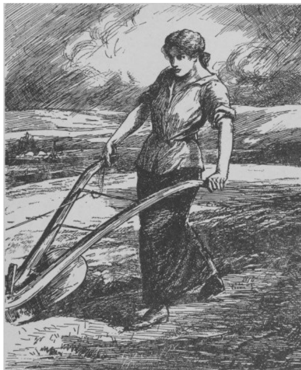
PRO PATRIA: A TRIBUTE TO WOMAN'S WORK IN WAR-TIME.