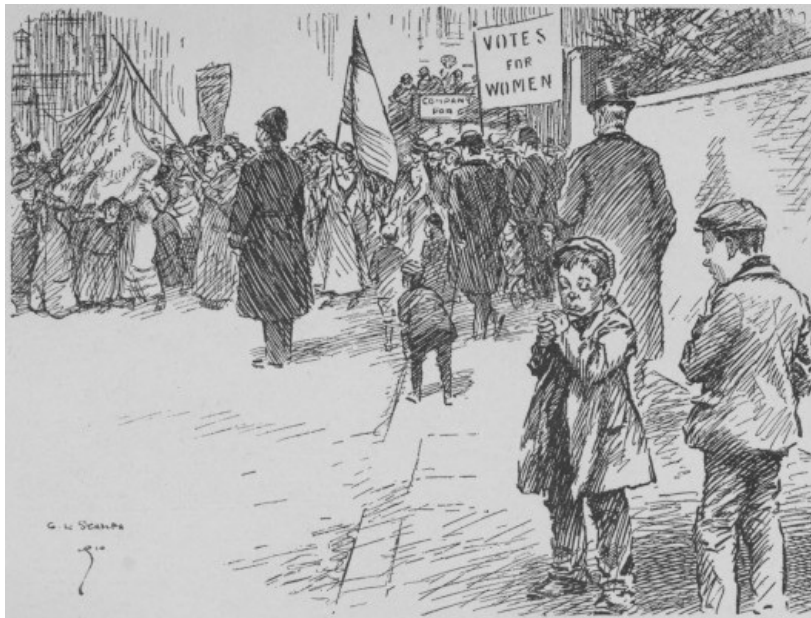
Man of the World (lighting up): "We'll 'ave to give it 'em, I expect, Chorlie!"

(Reproduced by special permission of the Proprietors of Punch .)