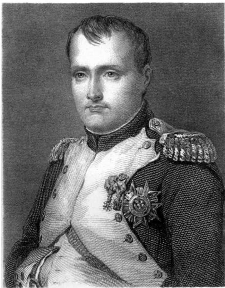
NAPOLEON BONAPARTE 1802