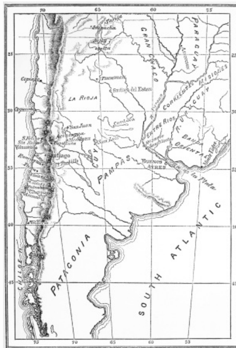
I.—MAP OF THE VICEROYALTY OF LA PLATA AND OF THE KINGDOM OF CHILE, EXCLUDING UPPER PERU AND SOUTHERN PATAGONIA.

San Martin gave verbal orders with great precision, and in ordinary conversation was fond of a joke. He wrote laconically in a style of his own, and was much given to reading French authors. Very reserved and of warm affections, he was a great observer of men, studying how he might best avail himself of such talents as they possessed. Haughty by nature, unobtrusive both by temperament and by system, he forced upon himself a stoical disregard of injuries. He was studiously moderate, and patient in the elaboration of his plans. A slave to duty himself, he was tolerant of human frailty in others, but could be severe when severity was requisite. He was, as with truth and with posthumous justice he has been styled by Vicuña Mackenna, "the greatest of the Creoles of the New World."