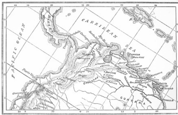
III.—MAP OF THE VICEROYALTY OF NEW GRANADA, INCLUDING VENEZUELA AND QUITO.

white, Europeans and Creoles, 913,000 were of indigenous races, 615,000 of mixed races, and 138,000 were negro slaves. Santa Fé de Bogotá was the capital of New Granada, Caracas was the capital of Venezuela. The City of Quito, situate high above the level of the sea, had been the centre of pre-Columbian civilization; during the colonial epoch it was at times attached to the Viceroyalty of New Granada, at times to that of Peru. The district of which this city was the capital has been styled the Thibet of the New World.