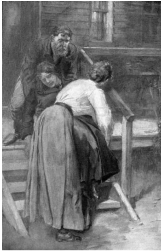
GRACE MEETS WITH AN ACCIDENT