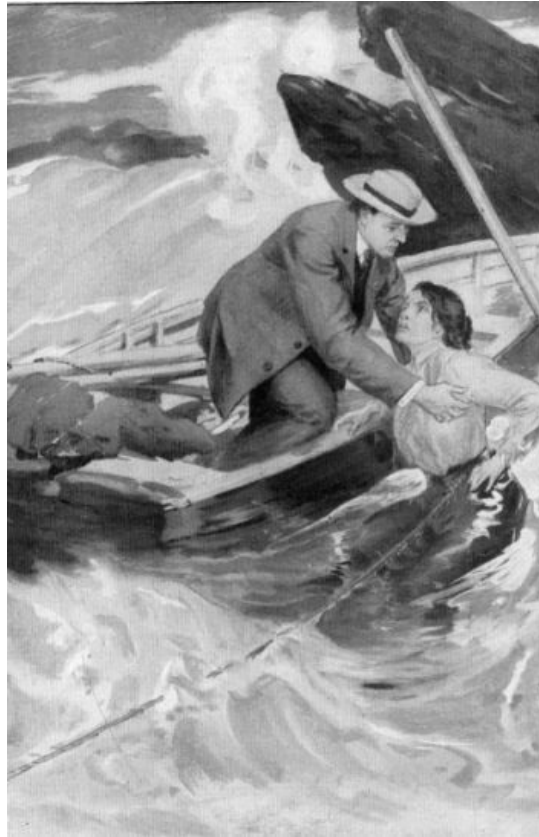
"SHE HAD REACHED THE BOAT"

A gurgle of irrepressible laughter shook Anne as she thought of what Hilda's feelings would have been if she could have heard the question, and then she answered hastily, "No, indeed; Hilda is not at home this evening. This is only Bertha, my youngest sister."