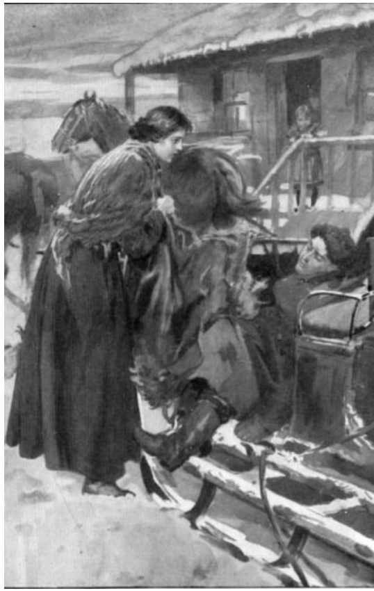
“THERE WAS A MAN LYING UNDERNEATH”