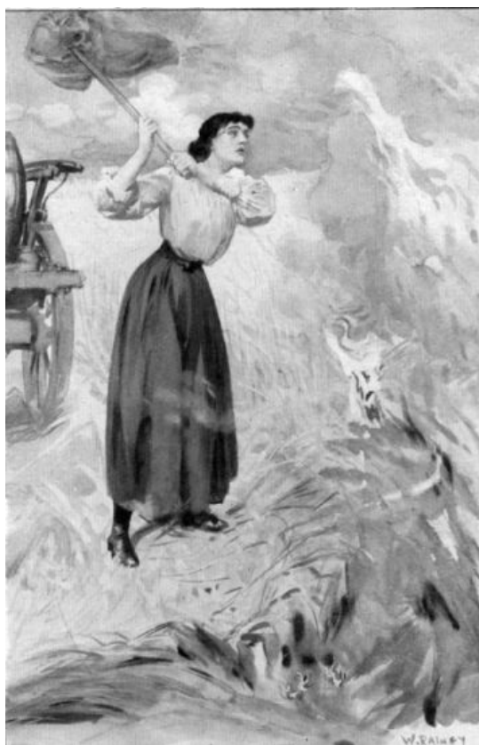
"SHE WAS MAKING NO HEADWAY"

"Oh, she was very cross, and declared that she would have to make haste and get better, if only to save me the expense of a funeral," said Tom; but he winced as he spoke, for Grace was everything to him, and the bare mention of her dying was more than he could endure.