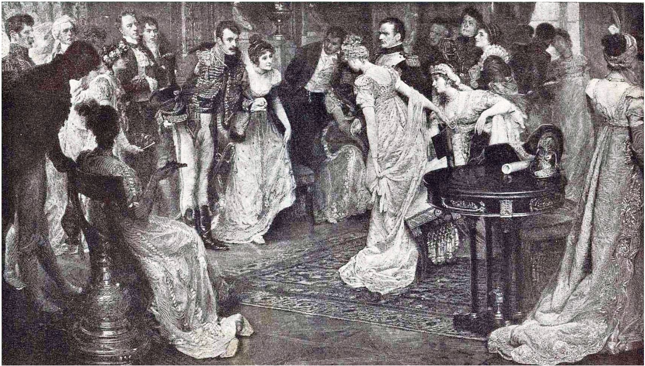
Bonaparte liked women to dress well, and, either, from policy or from taste, he encouraged his wife and sisters to do so.

she, on her side, was less suspicious of him. She adopted the advice which I constantly urged upon her, to treat such unworthy rivalry with disdain. "It would be quite time enough to fret," I said, "if the Consul chose one of the women in your own society; that would be a real grief, and for me a serious annoyance." Two years afterward my prediction was only too fully realized, especially as regarded myself.