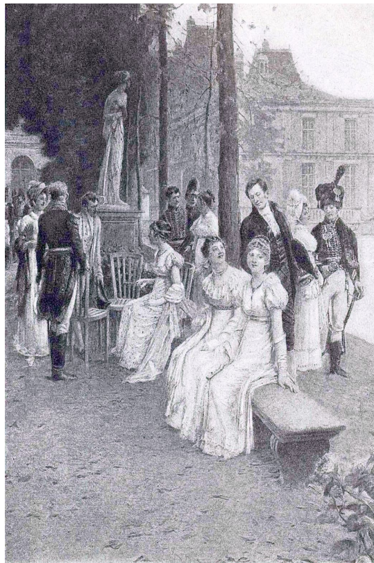
The Palace of Fontainebleau presented a strange spectacle just then, inhabited as it was by so extraordinary a medley of persons—sovereigns, princes, military officers, priests, women.