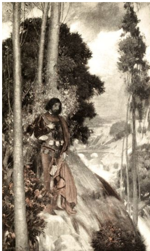
The same that Titian saw.

Driving after one has dined has always a peculiar charm. The motion seems pleasanter, the landscape finer than in the morning hours. The road from Cadore ran on a high level, through sloping pastures, white villages, and bits of larch forest. In its narrow bed, far below, the river Boite roared as gently as Bottom's lion. The afternoon sunlight touched the snow-capped pinnacle of Antelao and the massive pink wall of Sorapis on the right; on the left, across the valley, Monte Pelmo's vast head and the wild crests of La Rochetta and Formin rose dark against the glowing sky. The peasants lifted their hats as we passed, and gave us a pleasant evening greeting. And so, almost without knowing it, we slipped out of Italy into Austria, and drew up before a bare, square stone building with the double black eagle, like a strange fowl split for broiling, staring at us from the wall, and an inscription to the effect that this was the Royal and Imperial Austrian Custom-house.