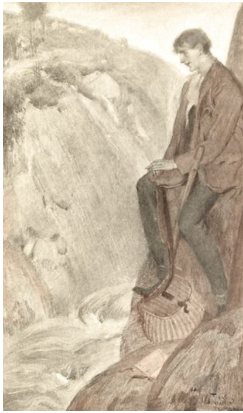
The moon slips up into the sky from behind the Eastern hills.

Then the moon slips up into the sky from behind the eastern hills, and the fisherman begins to think of home, and of the foolish, fond old rhymes about those whom the moon sees far away, and the stars that have the power to fulfil wishes—as if the celestial bodies knew or cared anything about our small nerve-thrills which we call affection and desires! But if there were Some One above the moon and stars who did know and care, Some One who could see the places and the people that you and I would give so much to see, Some One who could do for them all of kindness that you and I fain would do, Some One able to keep our beloved in perfect peace and watch over the little children sleeping in their beds beyond the sea—what then? Why, then, in the evening hour, one might have thoughts of home that would go across the ocean by way of heaven, and be better than dreams, almost as good as prayers.