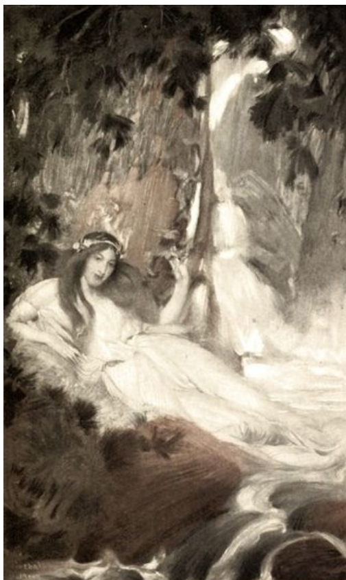
The bed whereon memory loves to lie

You are fishing down the Swiftwater in the early Spring. In a shallow pool, which the drought of summer will soon change into dry land, you see the pale-green shoots of a little plant thrusting themselves up between the pebbles, and just beginning to overtop the falling water. You pluck a leaf of it as you turn out of the stream to find a comfortable place for lunch, and, rolling it between your fingers to see whether it smells like a good salad for your bread and cheese, you discover suddenly that it is new mint. For the rest of that day you are bewitched; you follow a stream that runs through the country of Auld Lang Syne, and fill your creel with the recollections of a boy and a rod.