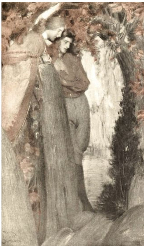
Lulling and soothing the mind into a quietude.

In the afternoon we sat on deck and looked at the water. What a charm there is in watching a swift stream! The eye never wearies of following its curls and eddies, the shadow of the waves dancing over the stones, the strange, crinkling lines of sunlight in the shallows. There is a sort of fascination in it, lulling and soothing the mind into a quietude which is even pleasanter than sleep, and making it almost possible to do that of which we so often speak, but which we never quite accomplish—"think about nothing." Out on the edge of the pool, we could see five or six huge salmon, moving slowly from side to side, or lying motionless like gray shadows. There was nothing to break the silence except the thin clear whistle of the white-throated sparrow far back in the woods. This is almost the only bird-song that one hears on the river, unless you count the metallic " chr-r-r-r " of the kingfisher as a song.