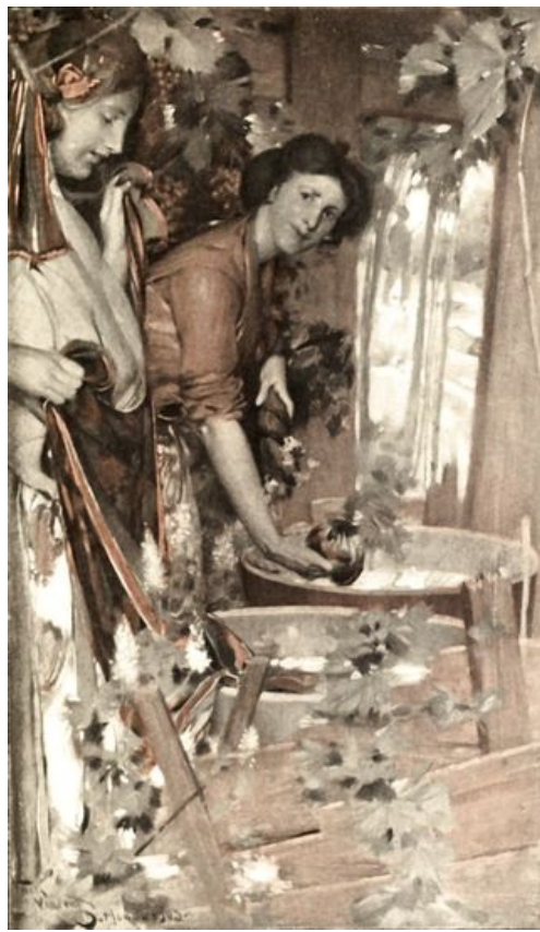
The farmer's daughters with bare arms and gowns tucked up.

In Professor John Wilson's Essays Critical and Imaginative , there is a brilliant description of a bishop fishing, which I am sure is drawn from the life: "Thus a bishop, sans wig and petticoat, in a hairy cap, black jacket, corduroy breeches and leathern leggins, creel on back and rod in hand, sallying from his palace, impatient to reach a famous salmon-cast ere the sun leave his cloud, ... appears not only a pillar of his church, but of his kind, and in such a costume is manifestly on the high road to Canterbury and the Kingdom-Come." I have had the good luck to see quite a number of bishops, parochial and diocesan, in that style, and the vision has always dissolved my doubts in regard to the validity of their claim to the true apostolic succession.