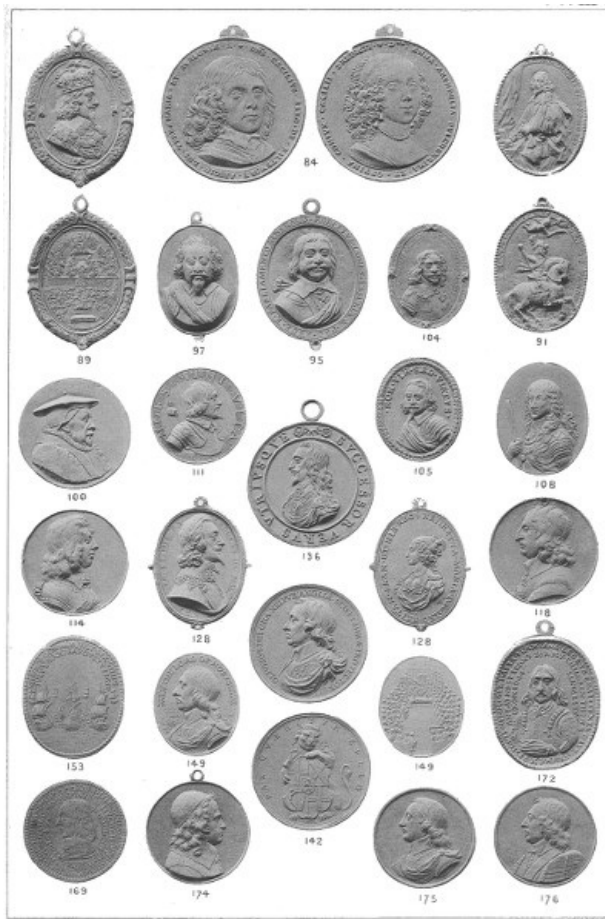
CHARLES I—COMMONWEALTH. ( \frac{5}{8} of the actual size.)