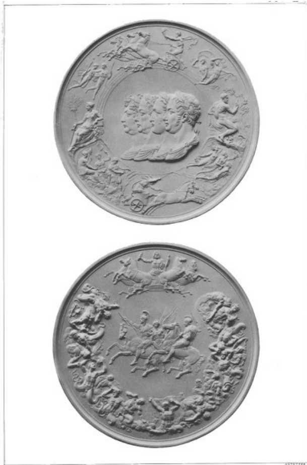
THE WATERLOO MEDAL N° 552. ( \frac{5}{8} of the actual size.)