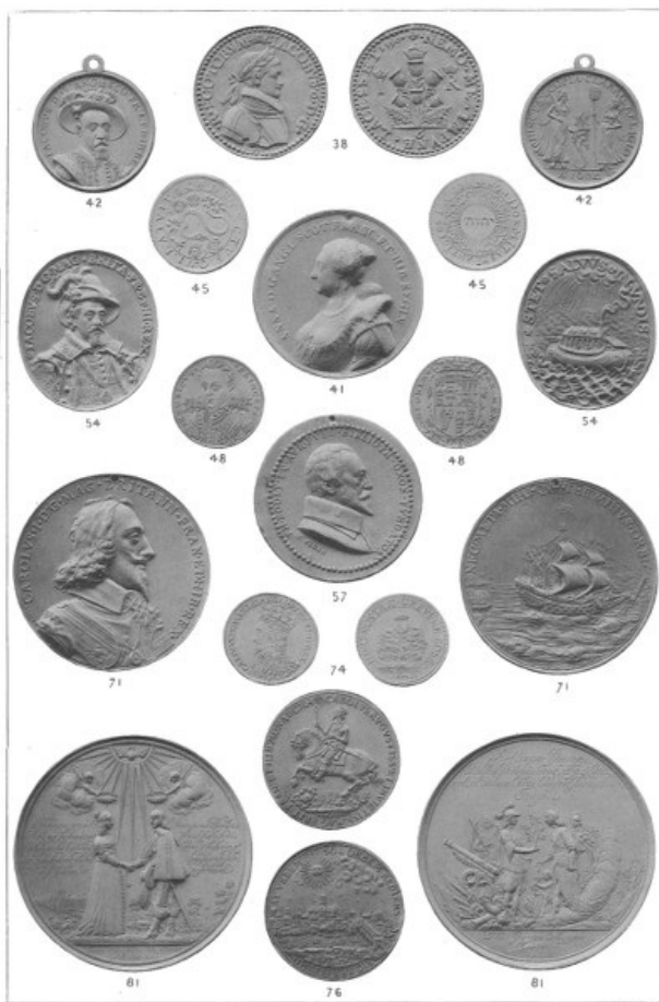
JAMES I—CHARLES I. ( \frac{5}{8} of the actual size.)