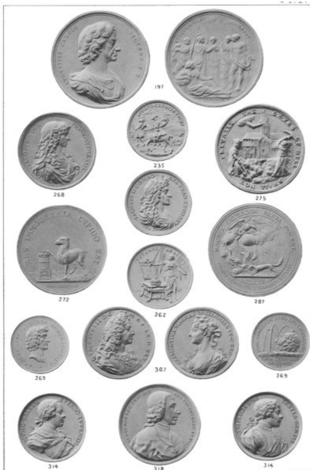
CHARLES II—STUART FAMILY. ( \frac{5}{8} of the actual size.)