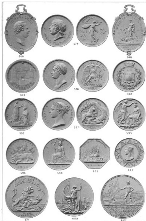
MILITARY & NAVAL MEDALS. ( \frac{3}{4} of the actual size.)