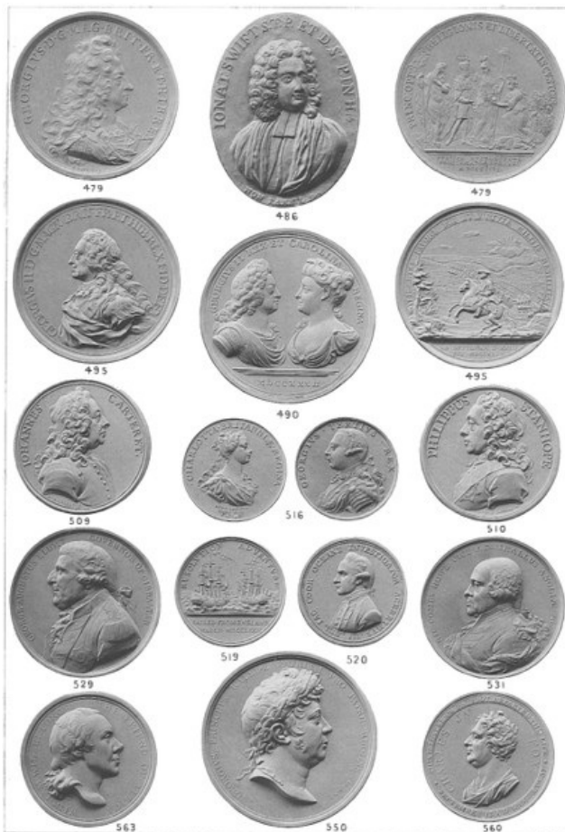
GEORGE I—GEORGE IV. ( \frac{4}{7} of the actual size.)