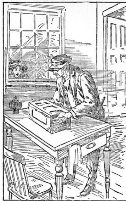
Grace Held Her Breath in Astonishment.

Suiting the action to the words, Grace stole softly up the deserted walk and crouched under the window from whence the light had come. Clinging to the window ledge, she cautiously raised herself until her head was on a level with the glass. What she saw caused her to hold her breath with astonishment. Was she awake or did she dream? At one side of the room stood a small table, and on the table, in full view of her incredulous eyes, stood the strong box which had held the bazaar money that had been spirited away on Thanksgiving night. Bending over it, the light from his dark lantern shining full on the lock, was the man whom she had accused on the train.