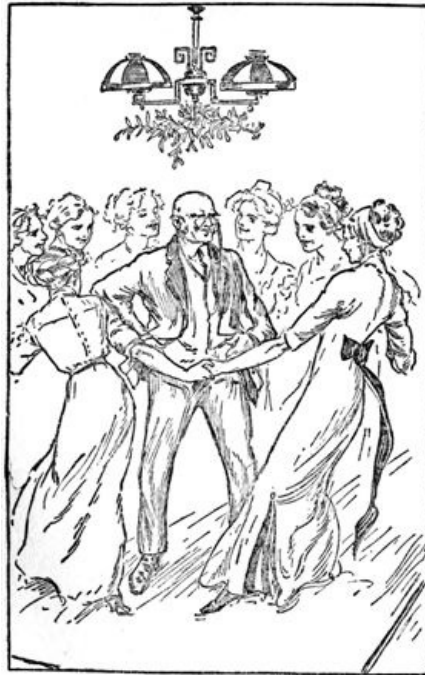
The Girls Circled Around the Judge.

"The mistletoe! The mistletoe! You're standing under the mistletoe!" was the cry and the seven girls and Miss Putnam joined hands and circled around the judge. Then each girl in turn stepped up and imprinted a kiss on the good old judge's cheek.