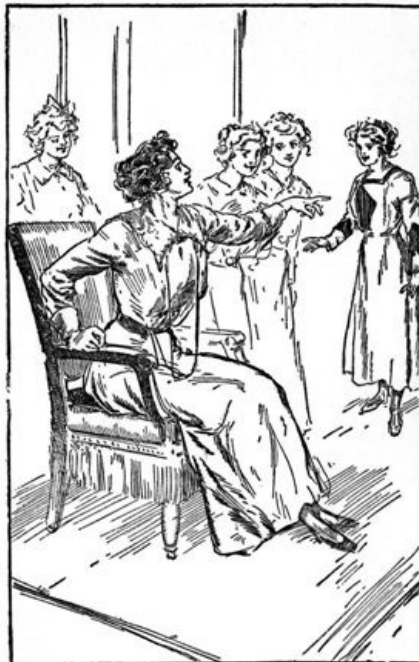
"Who Is That Girl?"