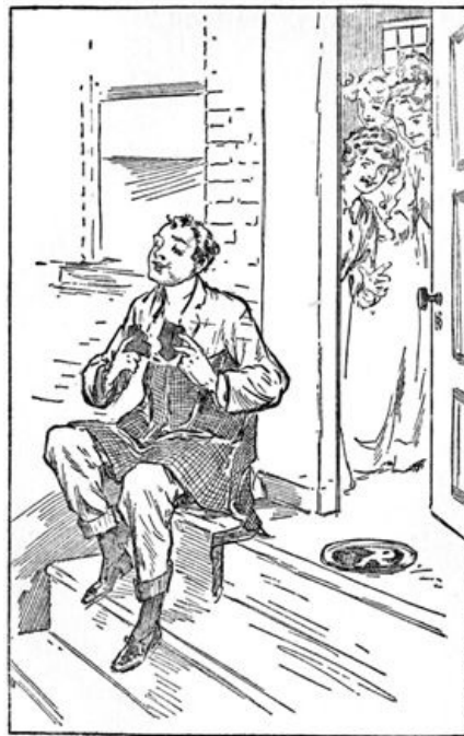
Hippy Sat With a Piece of Fudge in Either Hand.

But what Hippy really did say was never revealed, for David and Reddy laid violent hands upon their garrulous friend and, escorting him to the kitchen door, shoved him outside and calmly locking the door, left him to meditate in the back yard, until Nora suddenly remembering that she had set the fudge on the steps to cool, opened the door in a hurry to find Hippy seated upon the lower step, a piece of fudge in either hand, looking the picture of content.