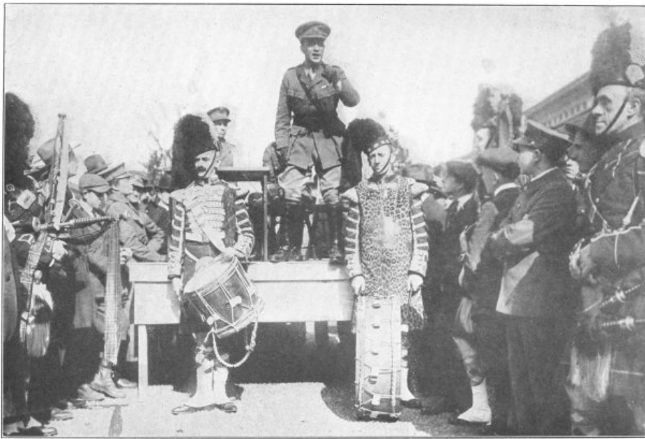
“British blood is calling British blood”

Brothers are these last in every degree of character to the American and Canadian miners, ranchers, trappers, cowboys; they are big, lean, brave, boyishly chivalrous men, shy of women but adoring them, willing to play romping dog any old time to win the smile of a child or the pat of its little hand. 7