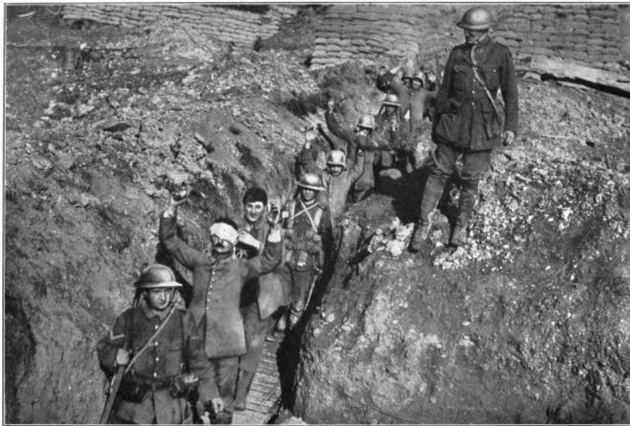
Bringing in prisoners