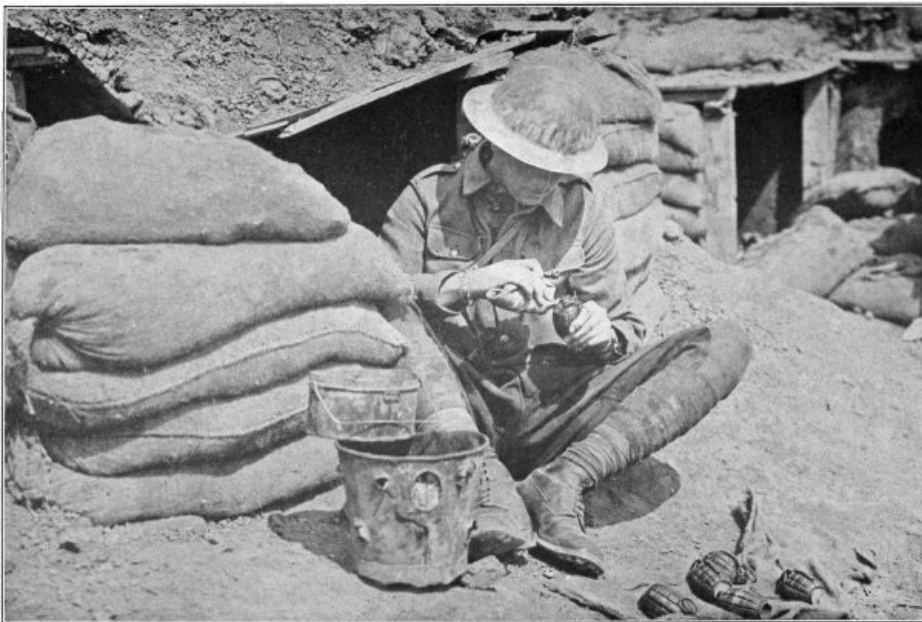
Cleaning Mills bombs

This I did within two weeks, having meanwhile had the honor of receiving a commission as lieutenant in the army, and with this promotion from the ranks, being assigned to the historic "Oxford and Bucks" (Oxfordshire and Buckshire) Light Infantry. The regular battalions of this old regiment were already in France, but my assignment was to assist in the training of the reserve battalions. 111