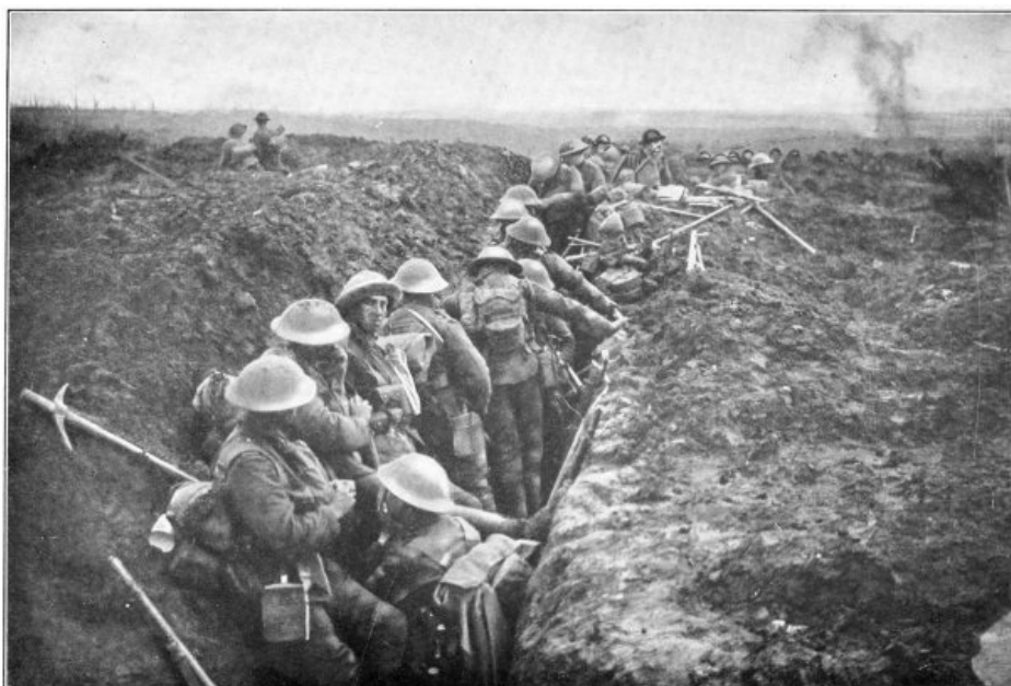
In the supports, waiting to advance

This last is the chief necessity of this particular game; it is invariably a duel of wits between individual fighters. Each unit concerned has to win its own little fight. It cannot as a rule expect help from its own troops on its flanks. For these cannot see to fire at the foe of the especially beleaguered unit. Besides if they seek to come to the aid of another unit, they cannot see because of the trees and shrubbery what they themselves may be leaving unguarded. Nor can an attacked force rely on the support and reserve coming up quickly. It’s slow moving in the woods.