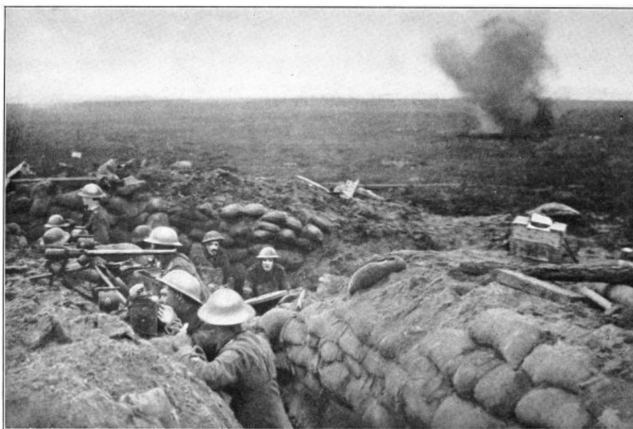
Waiting to "go over"

If we could battle through those lines to Moquet Farm and capture or put into retreat the batteries that had been constantly and effectively in use against us, it would mean that we would make the whole German position untenable and place ourselves in a position of great advantage in preparation for the great Somme drive. 168