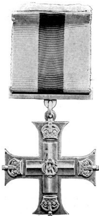
The Military Cross

When all the boats of our string had been filled, there came the order to the tugs: "Full steam ahead!"