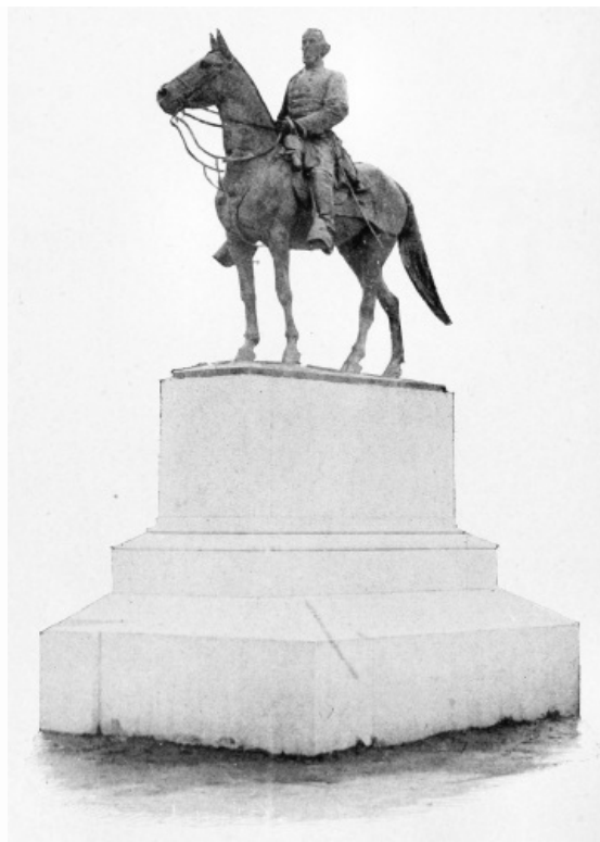
THE FORREST EQUESTRIAN STATUE. FORREST PARK, MEMPHIS, TENN.