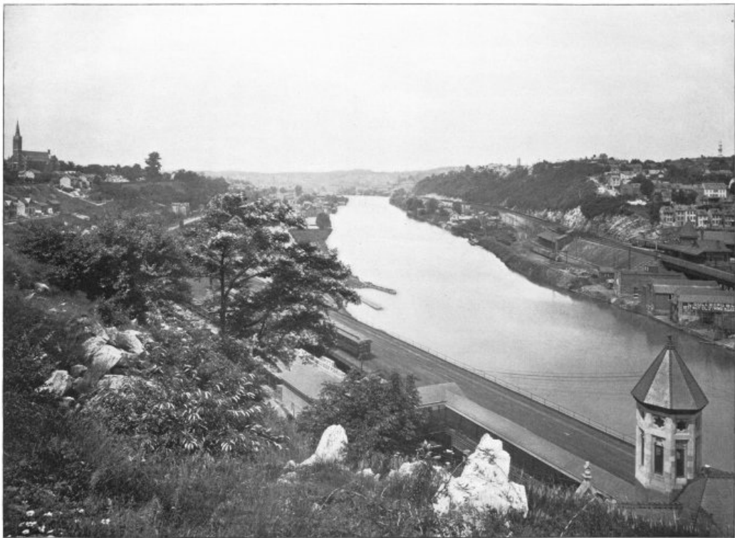
LEHIGH VALLEY FROM PICCADILLY HILL.