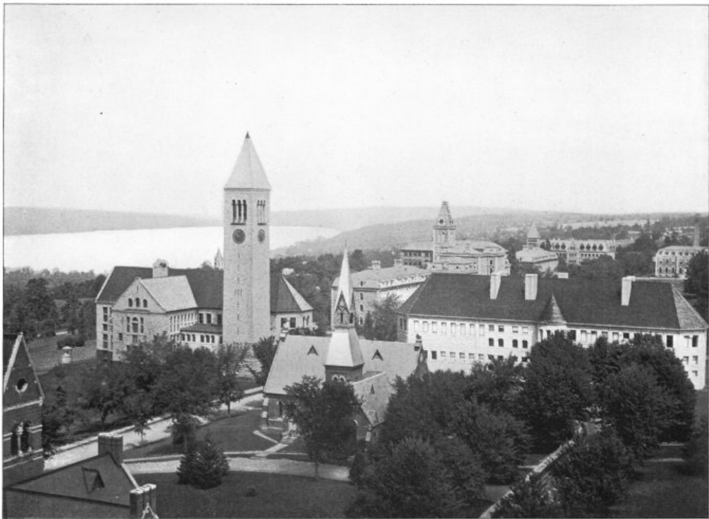
CORNELL UNIVERSITY AND CAYUGA LAKE, ITHACA.