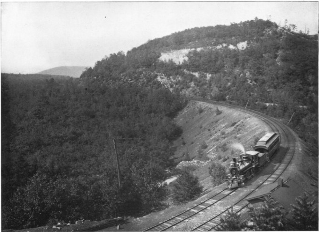
SWITCHBACK CURVE, QUAKAKE.