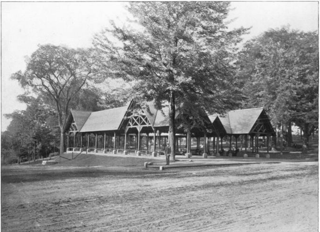
PIERCE'S PAVILION, CLIFTON SPRINGS.