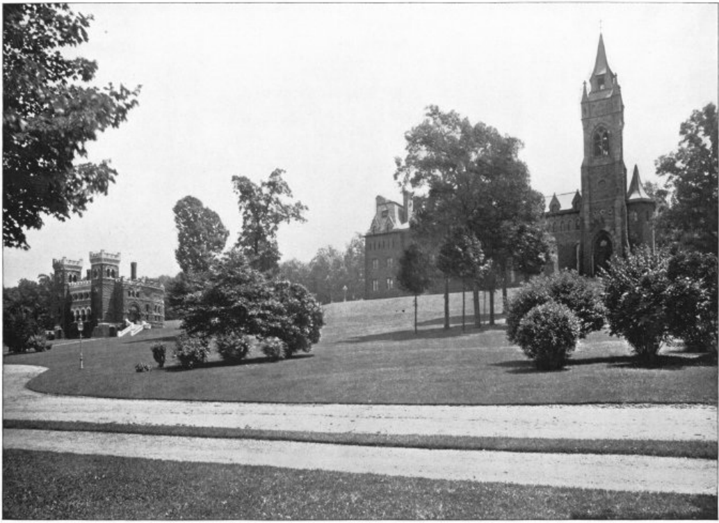
LEHIGH UNIVERSITY, SOUTH BETHLEHEM.