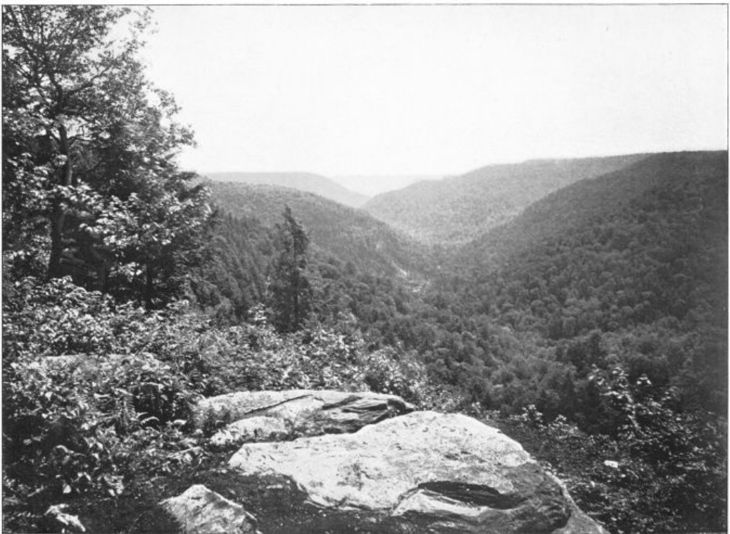
CLIFF VIEW, SUMMIT OF ALLEGHENIES.