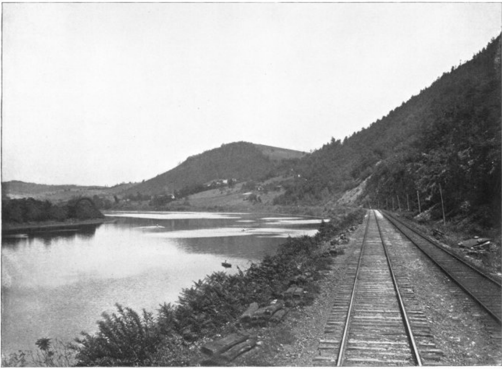
RED ROCKS, NEAR ALLEN'S.