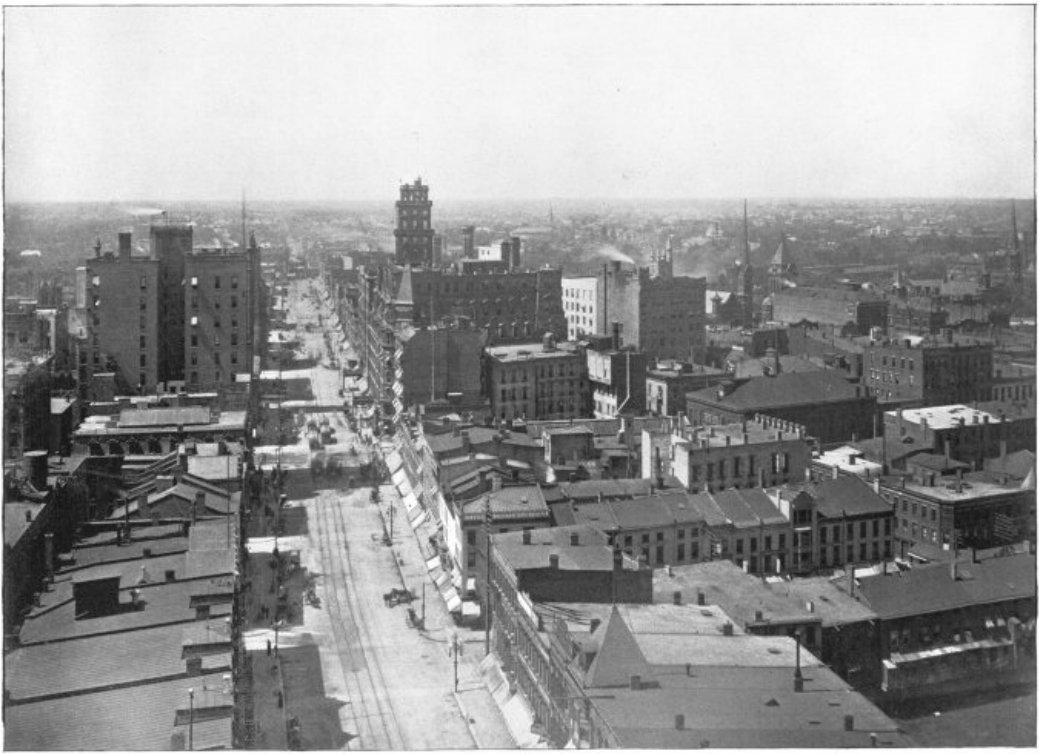
MAIN STREET, ROCHESTER.