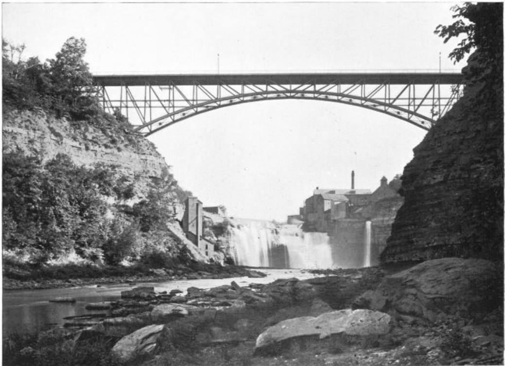
LOWER GENESEE FALLS, NEAR ROCHESTER.