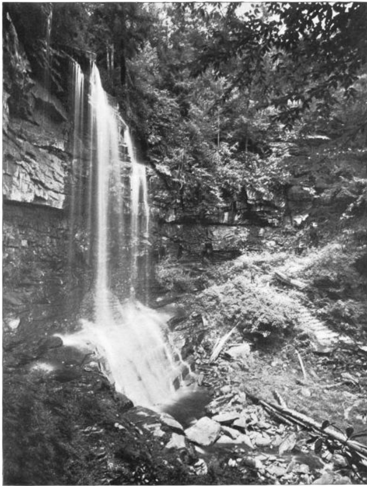
ONOKO FALLS, GLEN ONOKO.