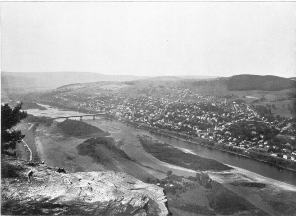
TOWANDA FROM TABLE ROCK.