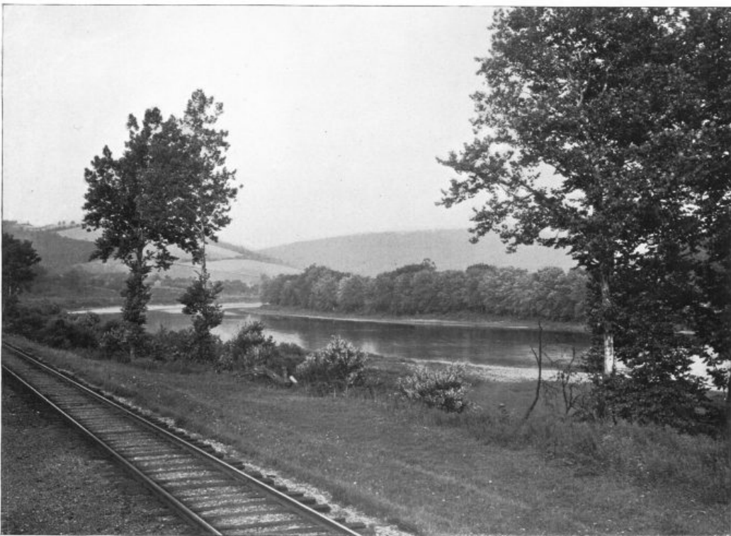
VIEW EAST OF STANDING STONE.