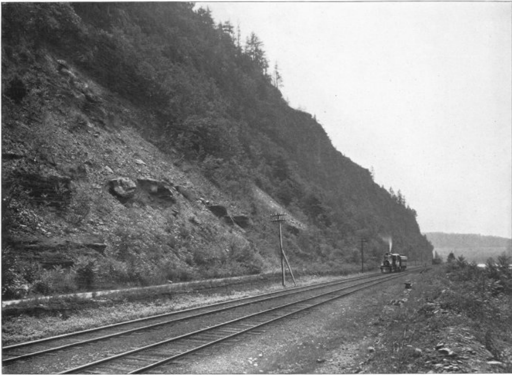
ROCKY BLUFF, NEAR FALLS STATION.