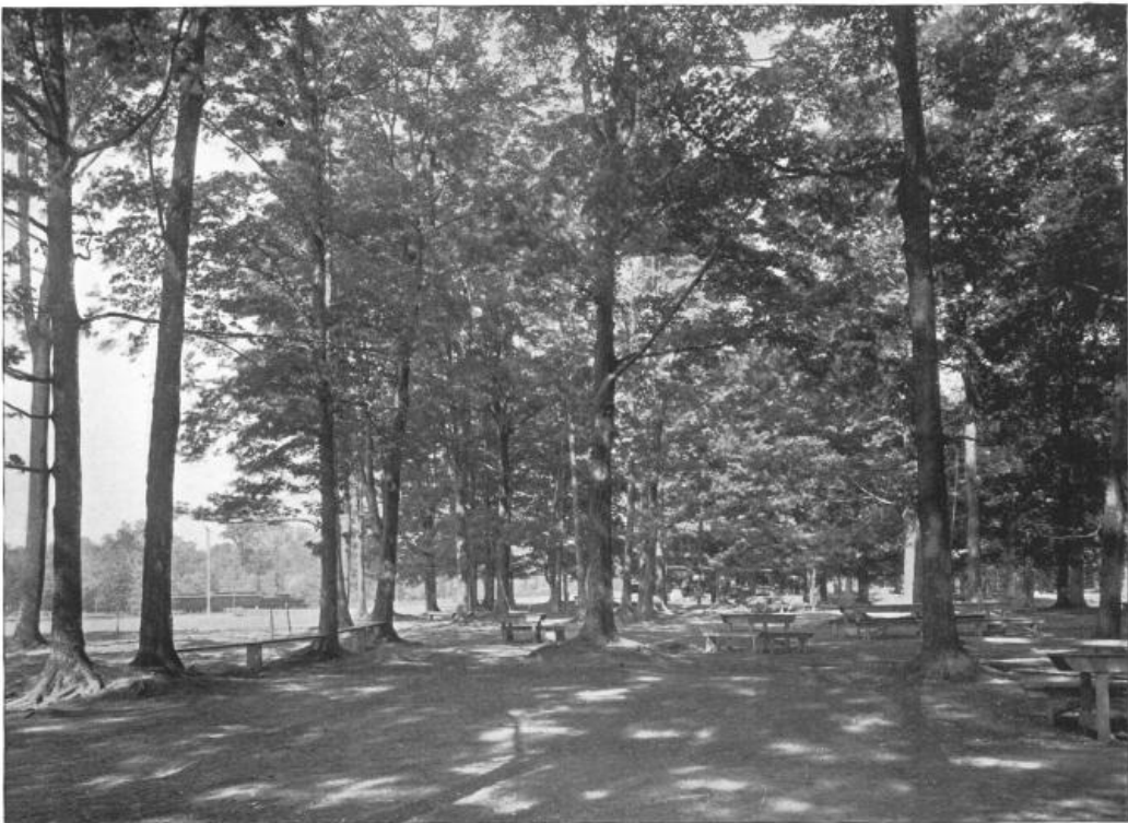
LONGWOOD EXCURSION GROUNDS.