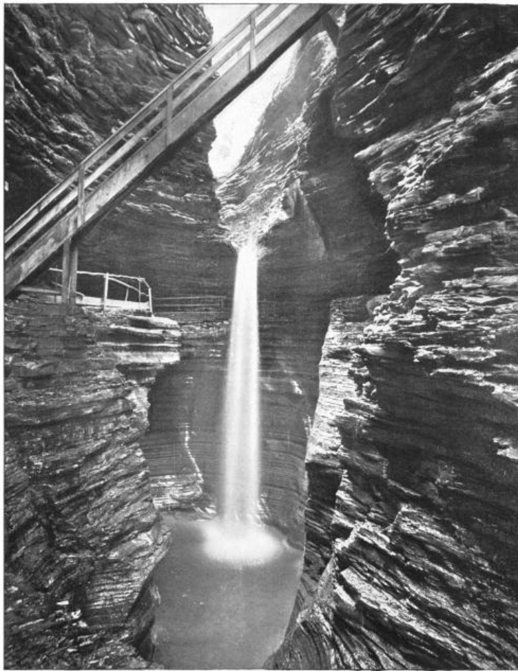
CAVERN CASCADE, WATKINS GLEN.