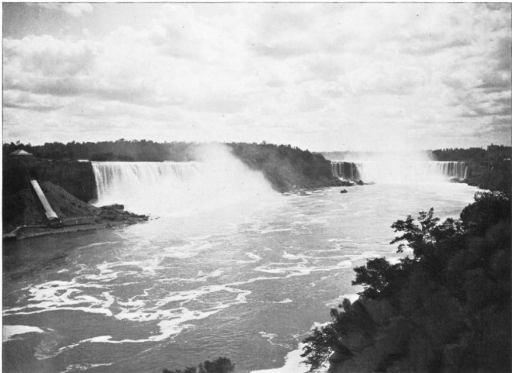
NIAGARA FALLS FROM THE BRIDGE.

Transcriber's Notes: This work presents a series of full page black-and-white photographs depicting various scenes along the Lehigh Valley Railroad (in the eastern parts of the U.S. states of Pennsylvania and New York), bound with an illustrated front cover.