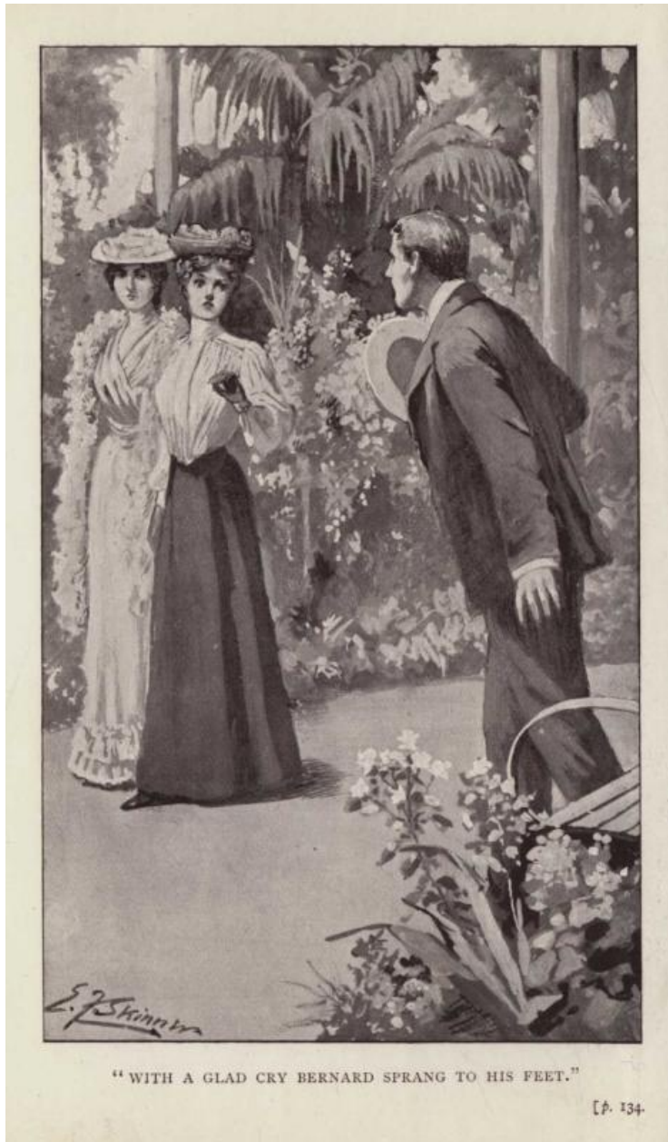
"WITH A GLAD CRY BERNARD SPRANG TO HIS FEET." (p. 134 )