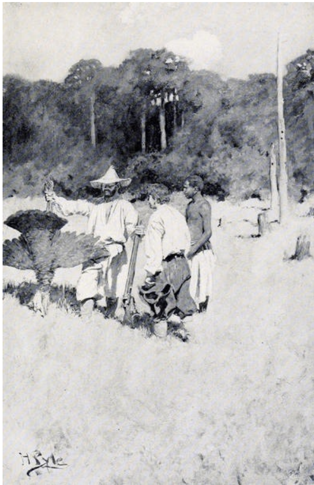
"HE PICKED UP THE BIRD AND HELD IT OUT AT ARM'S LENGTH."

The sun had set and the first shade of twilight was beginning to fall when they came out again from the woods and in sight of the Roost. As they came up to the row of cabins Kala came out to meet them. "De master he came home while ago," he said. "He be axing for you."