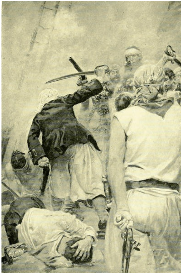
"THE COMBATANTS CUT AND SLASHED WITH SAVAGE FURY."