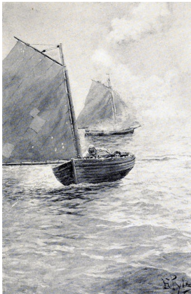
THE PIRATES FIRE UPON THE FUGITIVES.