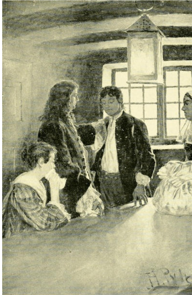
"COLONEL PARKER REACHED AND LAID HIS HAND UPON JACK'S SHOULDER. 'AY,' SAID HE, 'TIS A GOOD HONEST FACE.'"

A while later Jack was awakened from a sound sleep by some one shaking him. He opened his eyes and saw that a rough, red face was bending over just above him. In the first instant of waking he could not remember where he was, or what face it was looking down at him. Then he recognized Captain Dolls. He was, first of all, conscious of a throbbing, beating pain in the palms of his hands. It seemed to him that he had been feeling it all night.