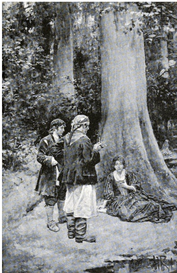
“THEY FOUND HER STILL SITTING IN THE SAME PLACE.”

“Over yonder,” said Jack, pointing toward the tree. He was profoundly stirred by what he had seen. She had not looked like herself. She had looked like some forlorn, hunted animal. When Jack came back with Dred they found her still sitting in the same place, just as he had left her. Dred stood looking down at her for a moment or two. Perhaps he also felt something of that which had so moved Jack. Then he stooped and laid his hand upon her shoulder. “You must come back with us, mistress,” he said. “You shouldn’t ha’ tried to run away; indeed, you shouldn’t. How long have you been out here?”