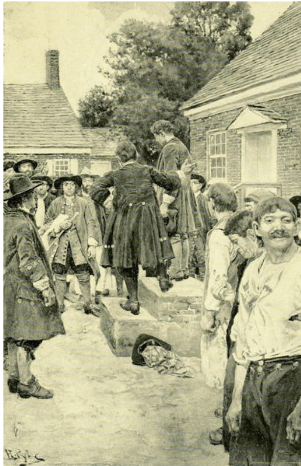
"NOW THEN, GENTLEMEN, HOW MUCH DO YOU BID FOR THIS BOY?" SAID THE AUCTIONEER."

The agent and the auctioneer stood by a horse-block talking together in low tones as the man who had marched Jack and the others down from the warehouse formed them in line against the wall of the building. The agent held a slip of paper in his hand, which he referred to every now and then. At last the auctioneer mounted upon the horse-block.