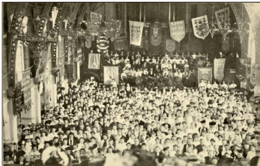
AN ANNUAL CONGRESS OF THE WOMEN'S CO-OPERATIVE GUILD.

LONDON: G. BELL AND SONS, LTD., YORK HOUSE, PORTUGAL STREET, KINGSWAY, W.C. NEW YORK: THE MACMILLAN CO. BOMBAY: A. H. WHEELER AND CO.