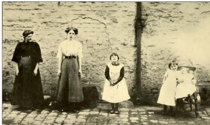
FIFTEEN CHILDREN, FOUR LIVING. FATHER AN IRON MOULDER.

The family is not connected with the Women's Co-operative Guild.