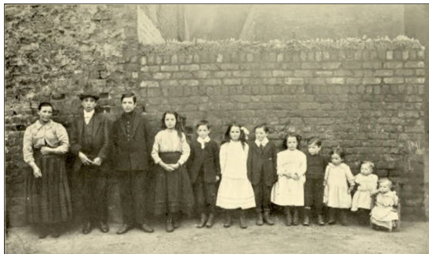
ELEVEN CHILDREN BORN, ALL LIVING. FATHER A FISH-HAWKER.

This family is not connected with the Women's Co-operative Guild.