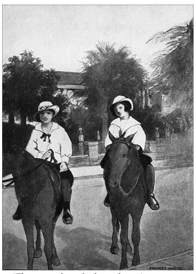
"They turned south, down the quiet, narrow street at the right" (Page 90) Frontispiece