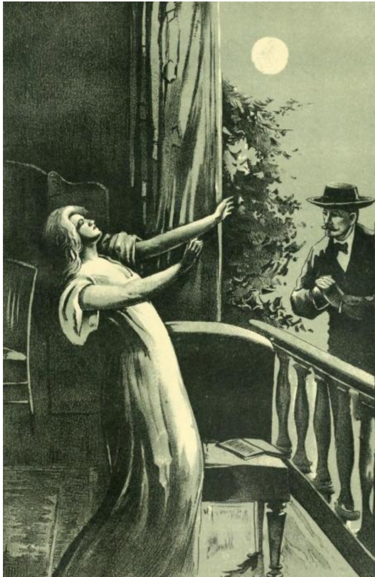
"SHE SPRANG WILDLY TO HER FEET. IT WAS HE!"

She sprang wildly to her feet! It was he! And, without even reflecting that somebody might see them, she threw herself upon his breast.