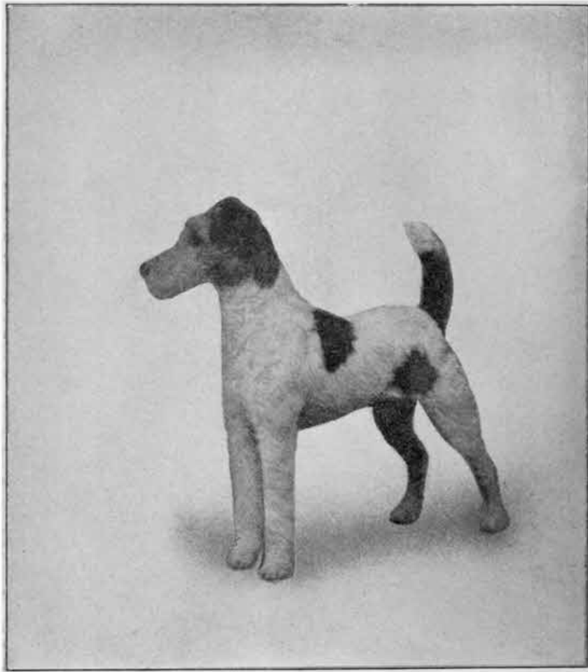
I AM AN OPEN-FACED, WIRE-HAIRED FOX-TERRIER