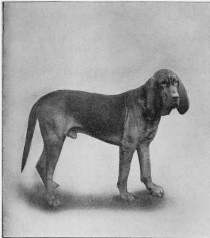
KING HARRY, THE BEST SPECIMEN OF A BLOODHOUND I EVER SAW

Beside Cannie, we have King Harry, the best specimen of a bloodhound I ever saw . His magnificent domed head, and wrinkled forehead give him an appearance of great wisdom. His eyes are small and deep-set, with a third eyelid. His ears are long and fine in "leather," and hang close to his kind old cheeks. His muzzle is long, deep and blunt at the tip, and he has a dewlap in the front of his throat.