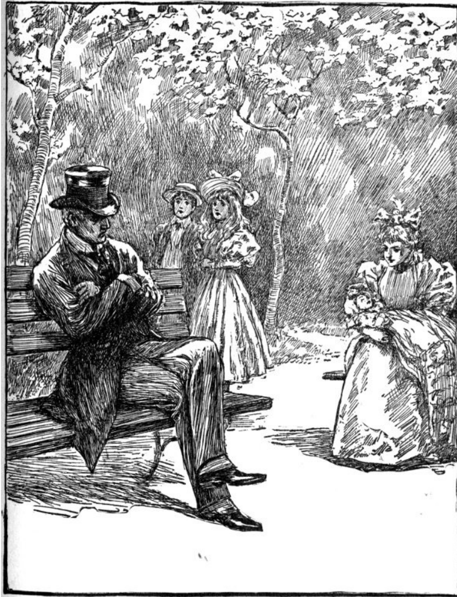
HE WAS LOOKING AT HER IN AN ABSENT, MISERABLE WAY.

"I see what you meant, Meg," Robin said. "He does look as if something was the matter with him. I wonder what it is?"