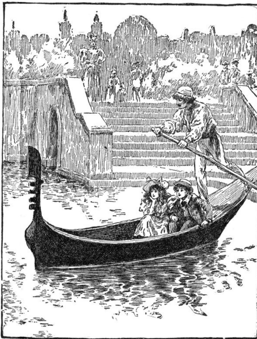
"NOW WE ARE IN VENICE."

And this was what they did. As they passed from picture to picture, each took turns at building up explanations. Some of them might have been at once surprising and instructive to the artist concerned, but some were very vivid, and all were full of young directness and clear sight, and the fresh imagining and coloring of the unworn mind. They were so interested that it became like a sort of exciting game. They forgot all about the people around them; they did not know that their two small, unchaperoned figures attracted more glances than one. They were so accustomed to being alone, that they never exactly counted themselves in with other people. And now, it was as if they were at a banquet, feasting upon strange viands, and the new flavors were like wine to them. They went from side to side of the rooms, drawn sometimes by a glow of color, sometimes by a hinted story.