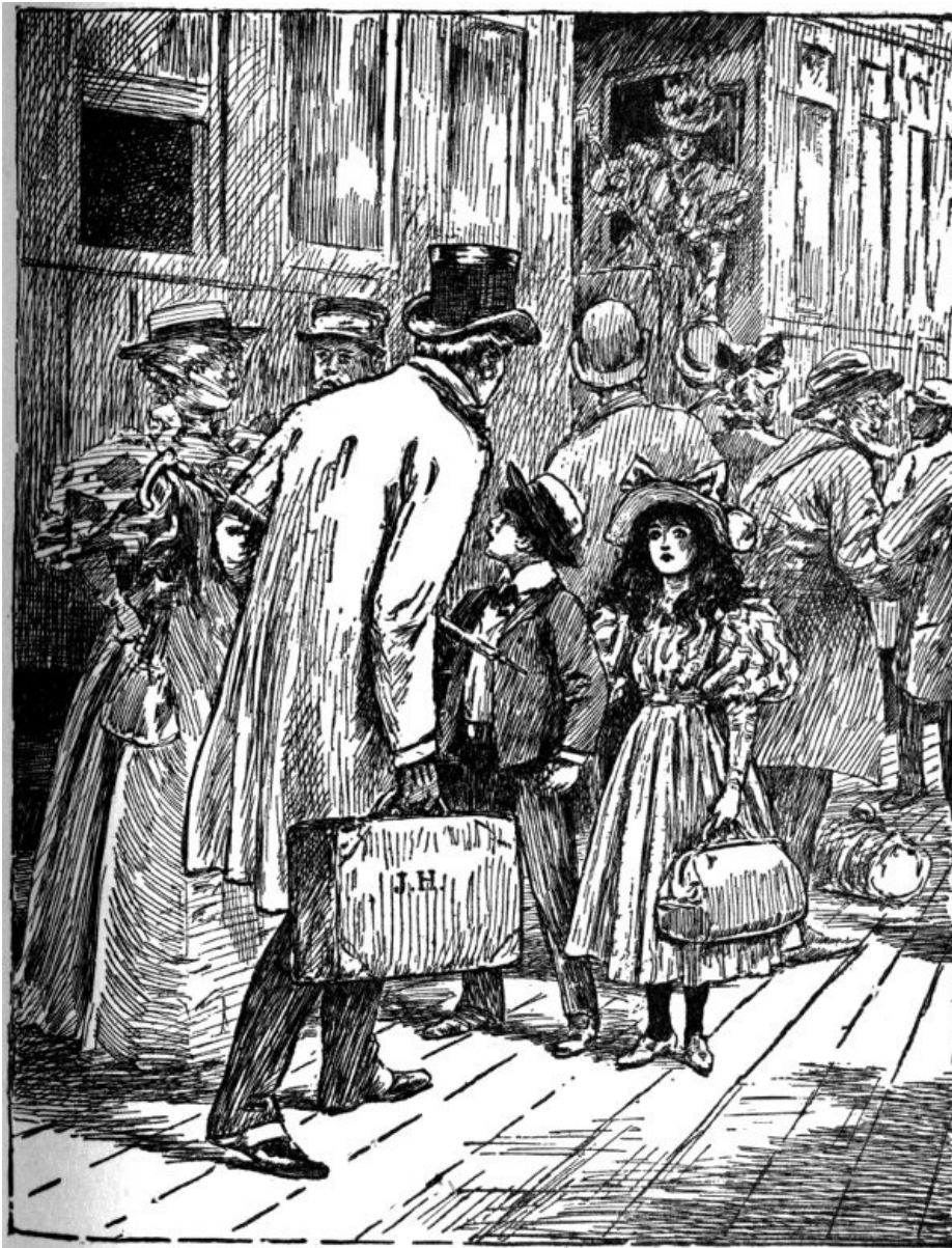
"IS THIS THE TRAIN TO CHICAGO?" SAID ROBIN.

"Is this the train to Chicago?" said Robin, breathlessly.