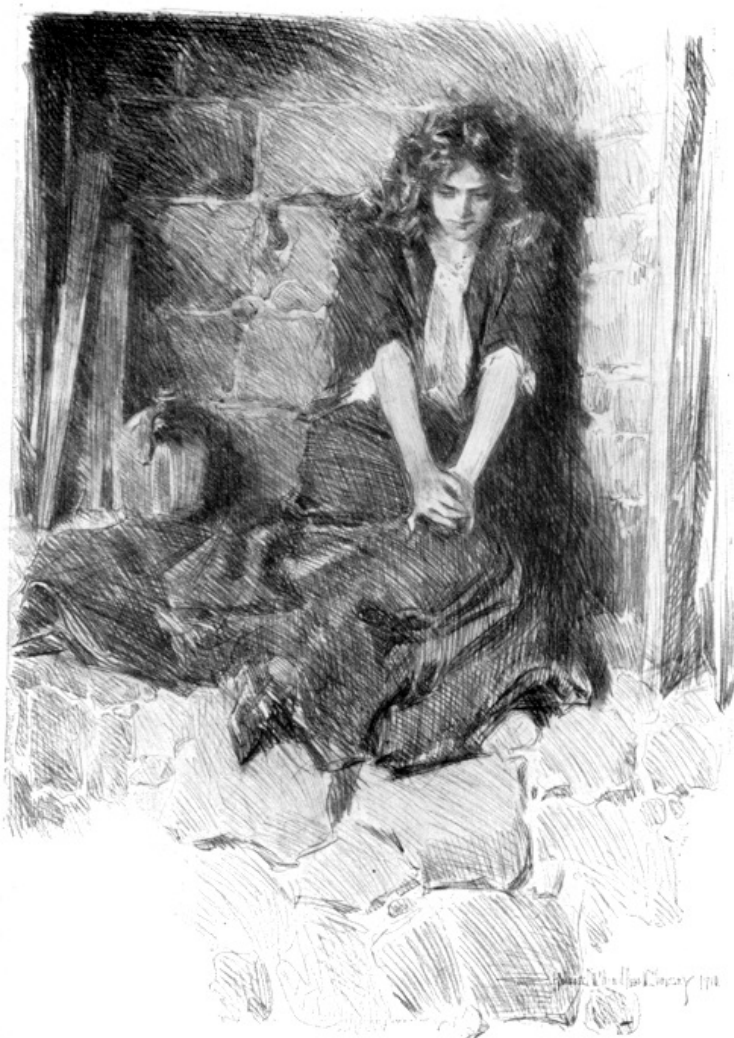
She did not look up when they entered

She did not look up when they entered—apparently she thought it was Janoc who had come, and with fixed, mournful eyes, like one gazing into profundities of vacancy, she continued to stare at the floor. Her face and air were so pitiable that the hearts of the men smote them into dumbness.