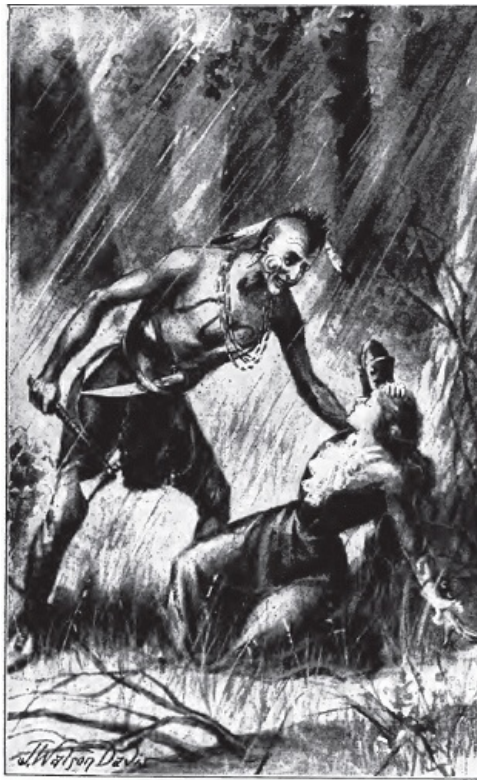
Edith felt a strong arm seize her by the shoulder, and turning her head in terror, she beheld the gleaming eyes of an Indian. Page 281. — Ticonderoga .

Almost as he spoke, from every side but that which opened upon the hill, came a yell, so loud, so fierce, so fiend-like, that ere she knew what she was doing, under the sudden impulse of terror, Edith darted at once away from the tree into the open space, and ran a few steps till her long riding dress caught round her small feet, and she fell upon the grass. At the same instant she felt a strong arm seize her by the shoulder and heard the rattle of a rifle, and turning her head in mute terror, she beheld the gleaming eyes and dark countenance of an Indian, rendered more hideous by the half-washed off war paint, bending over her. His tomahawk was in his right hand; her last hour seemed come, but so sudden, so confounding had been the attack that she could not collect her ideas. She could not speak, she could not think, she could not pray. The weapon did not fall, however, and the savage dragged her up from the ground and gazed upon her, uttering some of the uncouth exclamations of his people in tones of satisfaction and even merriment.