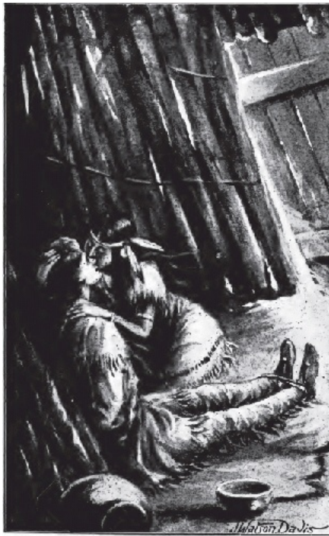
"My brother--my husband," she said. "Otaita has found thee at length." Page 215.

"My brother--my husband," she said, leaning her forehead on his shoulder, "Otaita has found thee at length!"