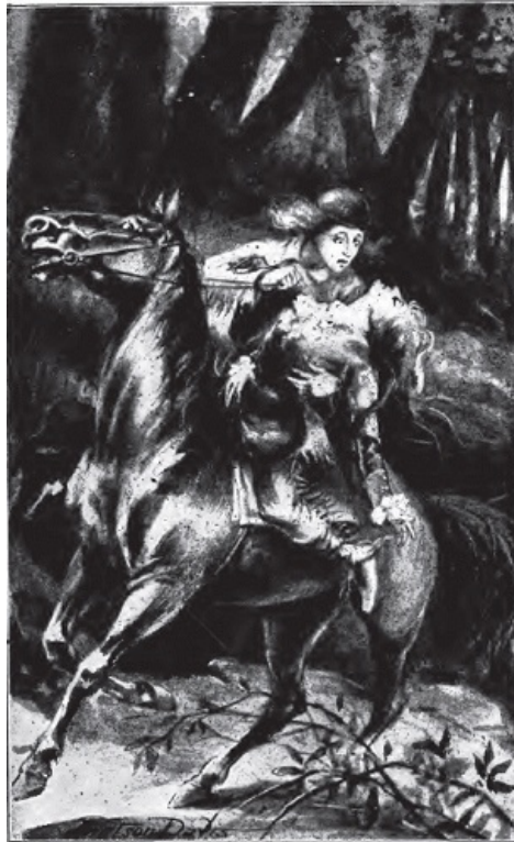
He trembled like a leaf. "Edith!" he said, "Edith!" There was no answer. She had died without a cry. Page 374. —Ticonderoga.

It was all he said, but in an instant they gathered round him, and lifted Edith from the horse. The surgeon put his hand upon the wrist, then shook his head sadly; and they laid her gently by the side of Lord H----; they knew not with how much propriety--but thus she would have loved to rest.