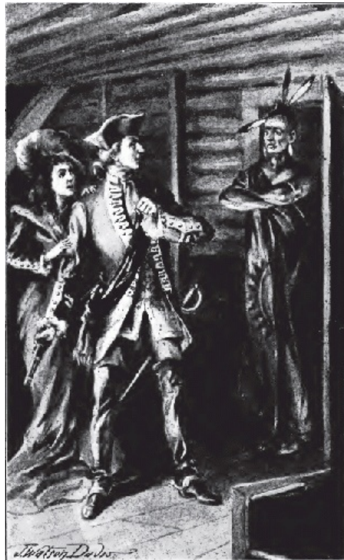
As a tall, dark figure glided into the room, Lord H---- drew Edith suddenly back and placed himself before her. Page 99. Frontispiece. —Titon Jorjgo.

He then reloaded the pistol, the charge of which he had drawn to light the fire, and was placing it in Edith's hand, when a tall, dark figure glided into the room with a step perfectly noiseless. Lord H---- drew her suddenly back and placed himself before her, but a second glance showed him the dignified form and fine features of Otaita's father.