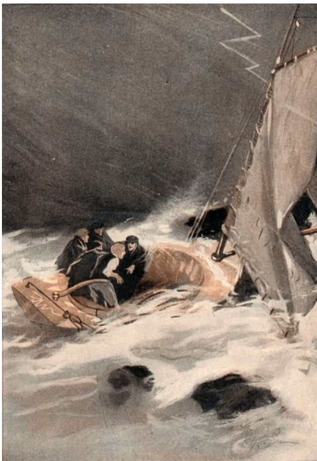
"Suddenly the boat's head swirled around."

"She's goin' over!" he cried. "She's sinkin'!"