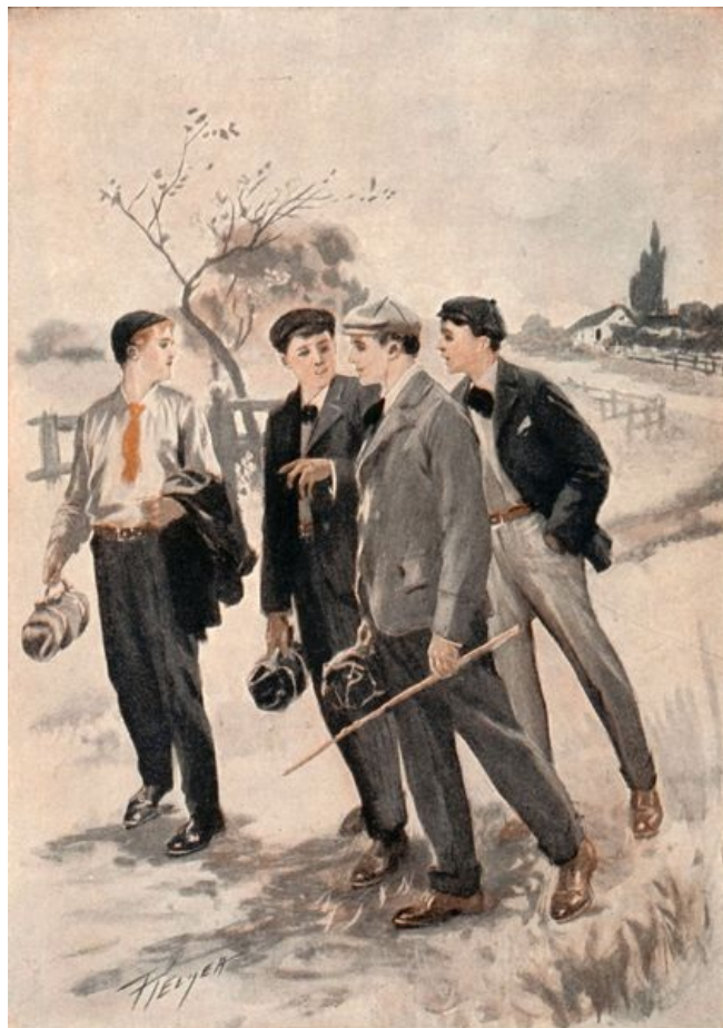
"Swinging along a country road on Long Island."