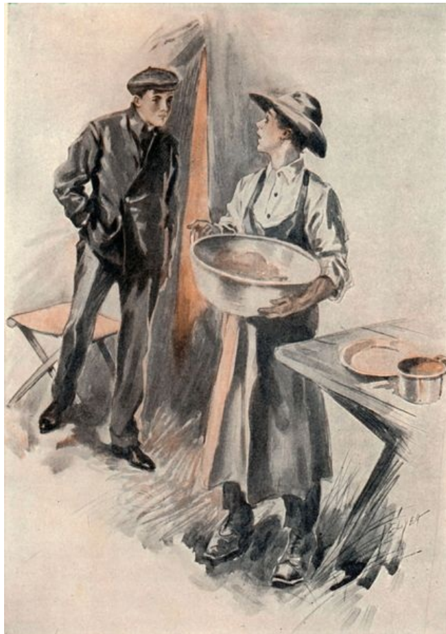
"Why! Hello, Jerry Hinkley!"

"Hello," responded Jerry with an embarrassed smile. He was quite a different-looking Jerry already. His hair had been cut, the faded overalls and blue gingham shirt had given place to a suit of plain, neat clothes, half-hidden by a long apron, and there was a new expression of self-reliance in the gray eyes. He shook hands with Nelson a bit awkwardly, but looked very glad to see him again.