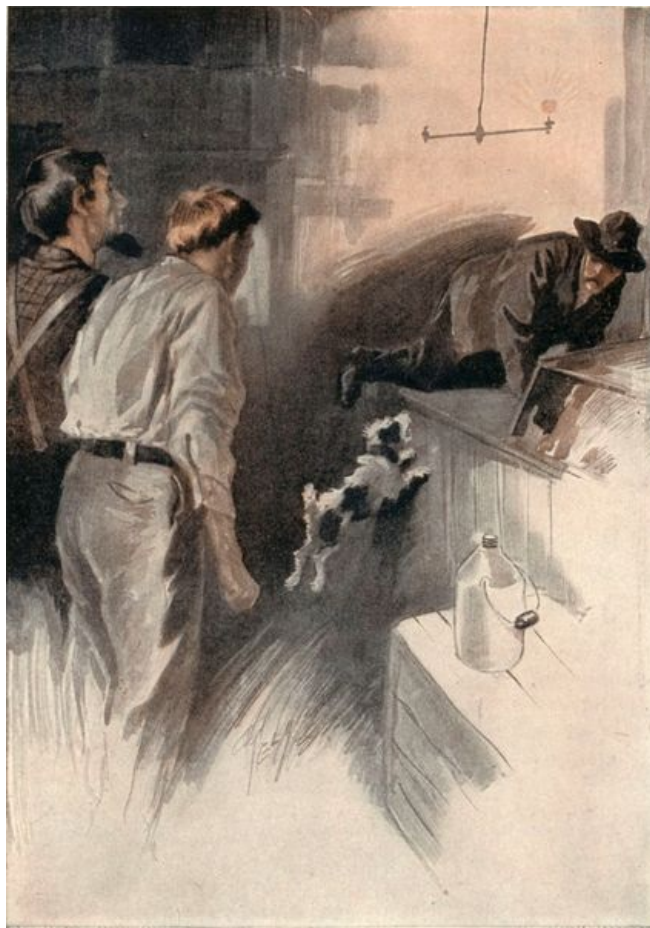
"Leaped excitedly at the counter."

"Barry!" called Dan. "Come here, sir! Come here!"