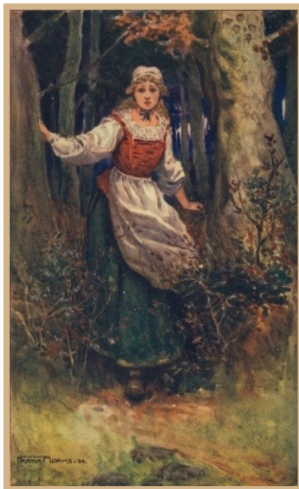
A YOUNG GIRL SUDDENLY EMERGED FROM THE UNDERWOOD

his horse with the intention of riding away, determined no longer to remain as a spectator.