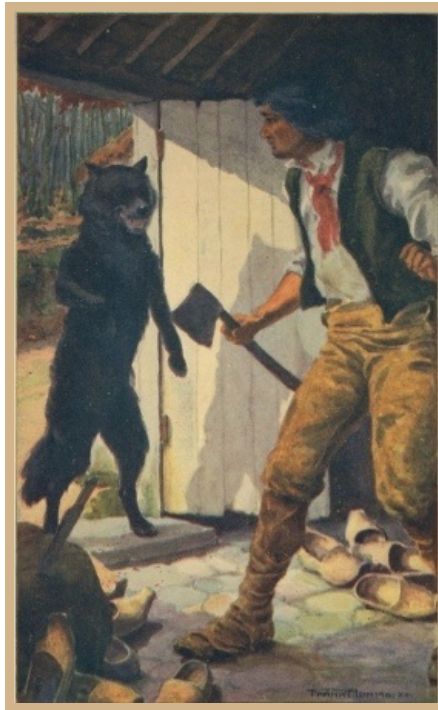
AN IMMENSE WOLF ENTERED THE ROOM, WALKING ON ITS HIND LEGS