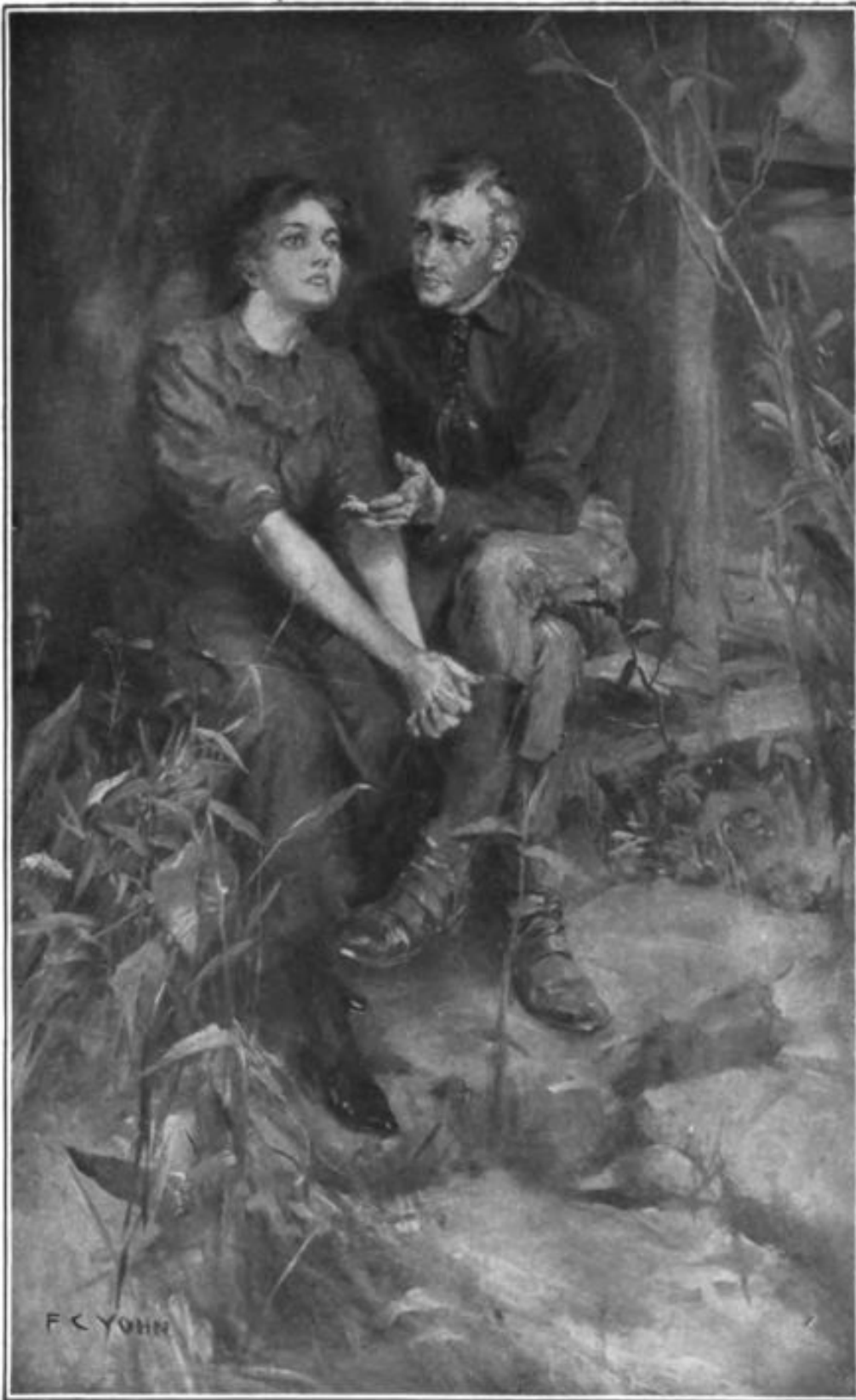
She made him tell of everything that had happened.

"Bub is a cowboy and wouldn't come back for the world, but I could never have been happy there," she said, "even if it hadn't been for you—here."