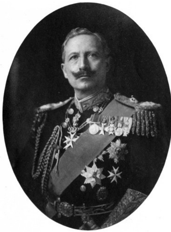
THE GERMAN EMPEROR IN ENGLISH ADMIRAL'S UNIFORM