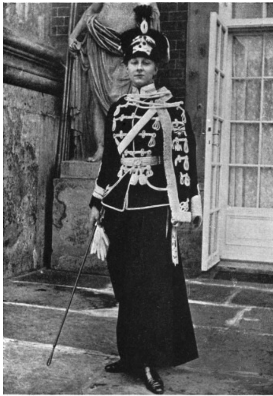
THE EMPEROR'S DAUGHTER. TAKEN ON THE DAY WHEN SHE WAS MADE COLONEL OF THE DEATH'S HEAD HUSSARS.

strike him as out of place—"so direct and forcible; couldn't have been better."