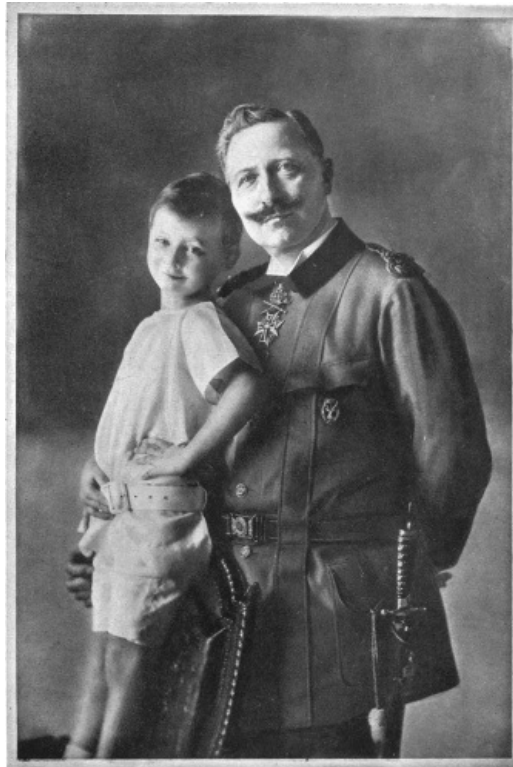
THE KAISER AND HIS ELDEST GRANDSON

About a mile from the New Palace lived the only unmarried sister of the Empress, the Princess Féodora of Schleswig-Holstein, a woman of many intellectual gifts and a very striking and interesting personality, possessing great influence over the children of her sister, who spent much time in "Tante Féo's" beloved society. Her ideas were very democratic. She detested the atmosphere of courts and all the restrictions and ceremonies incident to court existence. She was a very clever artist, and author of several books dealing with the life of the peasantry and showing a marvellous insight into their methods of thought.