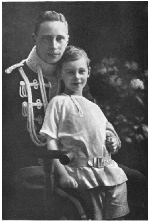
THE CROWN PRINCE AND HIS HEIR, PRINCE WILHELM

over had proposed to substitute in its place a rope, which, as he pointed out, "could be easily lowered as each girl jumped it"; but his suggestion meeting with no approval, rather with general derision as likely to make a mock of competitors, he retired from all further active participation in our gambollings.