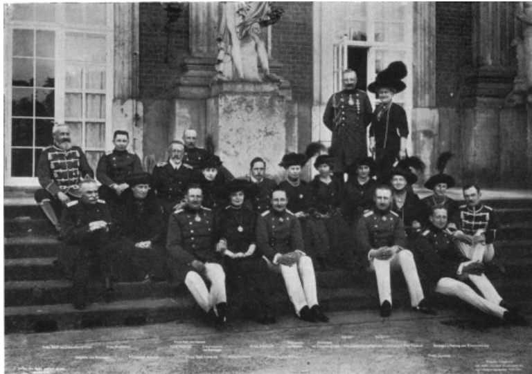
THE EMPEROR AND EMPRESS WITH MEMBERS OF THEIR FAMILY, TAKEN AT THE NEW PALACE, WILDPARK

The Crown Prince and Prince Fritz were, at the time of which I write, in Bonn studying at the University, Prince Adalbert at Kiel or roaming about the world on a warship, as he had chosen the navy for a profession; and the next two brothers, Princes August-Wilhelm and Oscar, together in Ploen, where they lived in a pleasant country house with their governor and various teachers, and enjoyed the companionship of the young cadets of the aristocratic school—the Eton of Germany—which is close at hand.