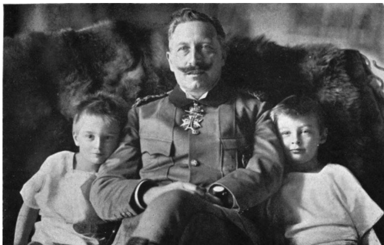
THE KAISER AND HIS TWO ELDEST GRANDSON'S, PRINCES WILHELM AND LOUIS FERDINAND OF PRUSSIA

The real business of Bescherung begins already upon the day before Christmas Eve, or even sooner. The Empress rushes from one Kinder-heim to another, to hospitals and schools, putting in a few minutes here and there, always with the same ready smile for every one, the same fresh look of interest in the oft-repeated ceremony, the oft-sung carol. She never tires of giving pleasure to others, and has little time to rest. It is a very busy day, too, for the Princess, for all the morning she is busy decorating a small tree for two needy