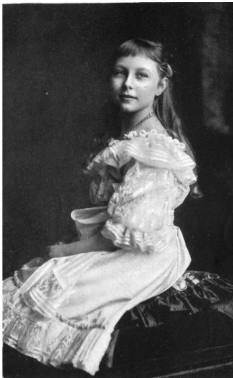
THE KAISER'S DAUGHTER, PRINCESS VICTORIA LOUISE (NOW DUCHESS OF BRUNSWICK) AT THE AGE OF NINE

This phase of "Papa's" character is forcibly, almost painfully, brought home to me when one day his daughter, in a moment of relaxation, seeks to amuse herself by practising the schoolboy trick—she is very schoolboyish—of making with her mouth and cheek the "pop" of a champagne cork and the subsequent gurgle of the flowing wine.