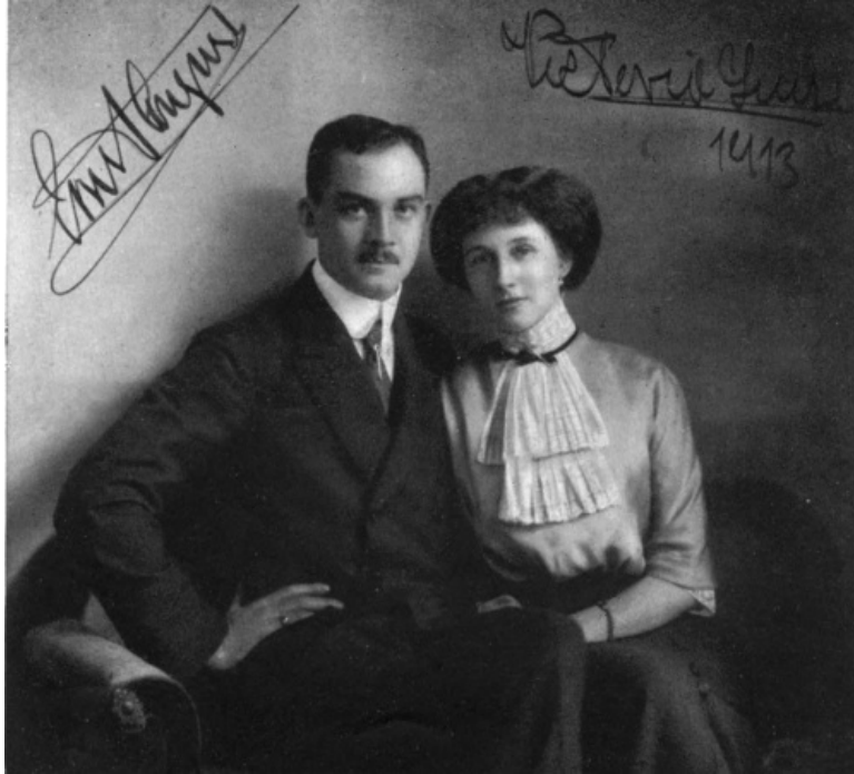
THE DUKE AND DUCHESS OF BRUNSWICK

Among his later literary admirations Kipling's poem