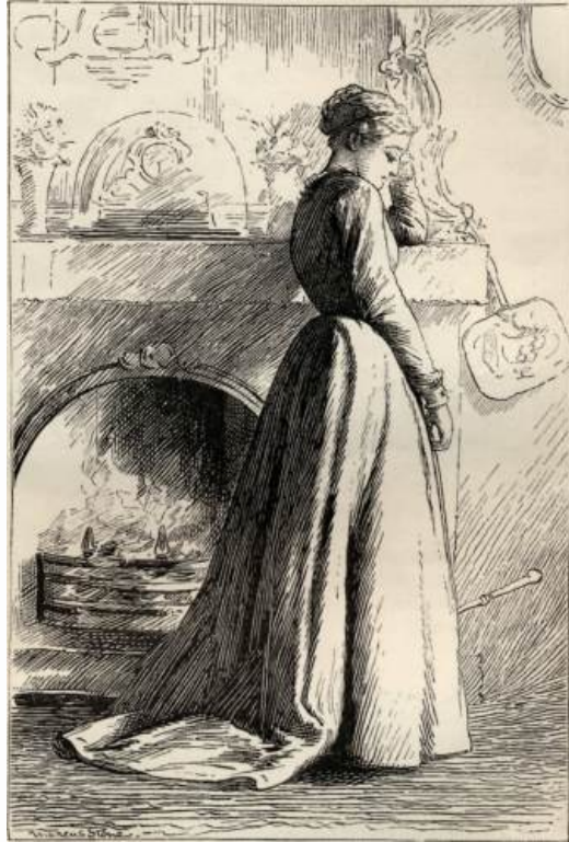
Dorothy makes up her mind.

"So I will," said Dorothy, and at that time her mind was made up.