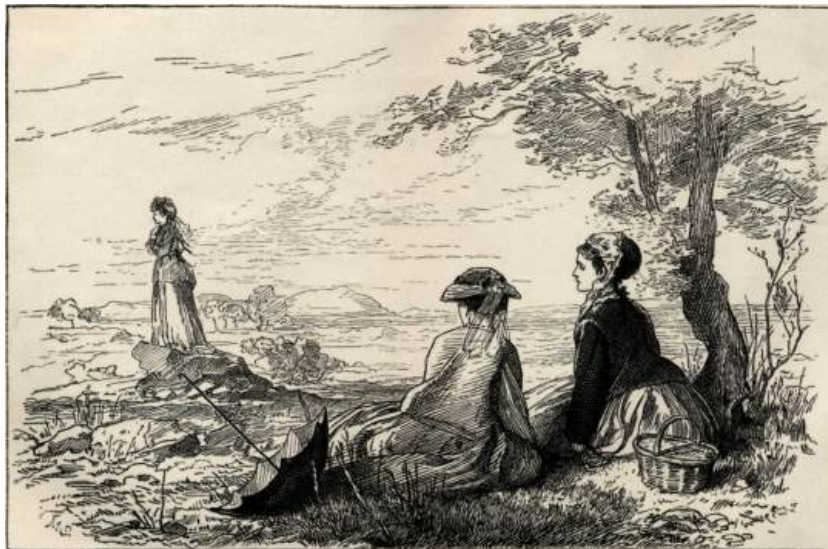
Nora tries to make herself believe.