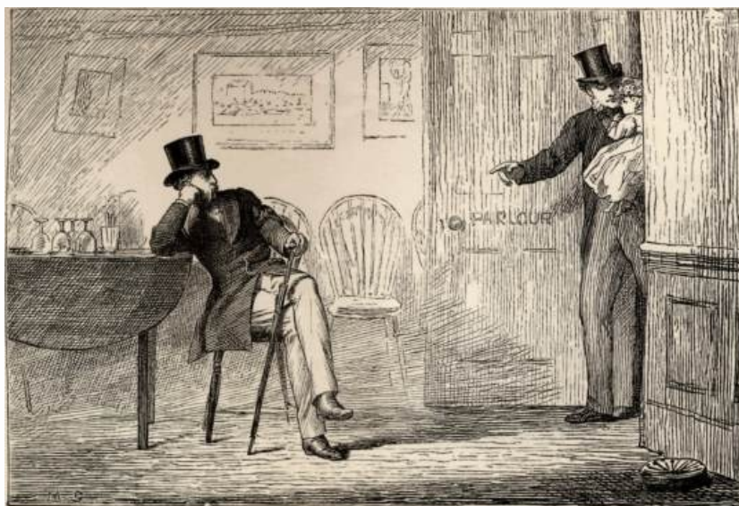
The "Full Moon" at St. Diddulph's.