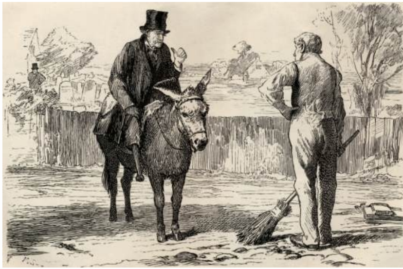
The wooden-legged postman of Nuncombe Putney.