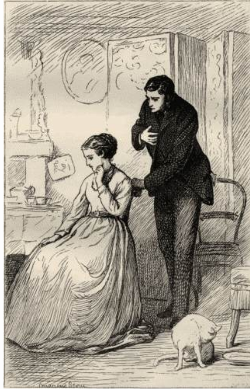
The world was going round with Dorothy.

her, she was not at once made happy by his love. Her ideas of herself and of her life were all dislocated for the moment, and she required to be alone, that she might set herself in order, and try herself all over, and find whether her bones were broken. "Say that you believe me," he repeated.