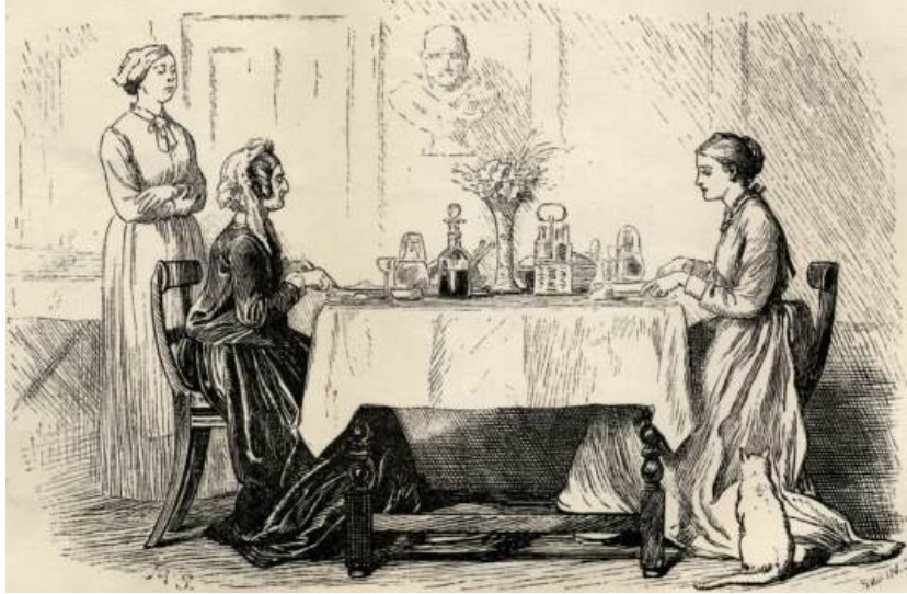
Aunt Stanbury at dinner will not speak.

impossible to hear her own brother abused without saying a word on his behalf. She did not see her aunt again till dinner-time, and then there was hardly a word uttered. Once or twice Dorothy made a little effort to speak, but these attempts failed utterly. The old woman would hardly reply even by a monosyllable, but simply muttered something, or shook her head when she was addressed. Jane, who waited at table, was very demure and silent, and Martha, who once came into the room during the meal, merely whispered a word into Miss Stanbury's ear. When the cloth was removed, and two glasses of port had been poured out by Miss Stanbury herself, Dorothy felt that she could endure this treatment no longer. How was it possible that she could drink wine under such circumstances?