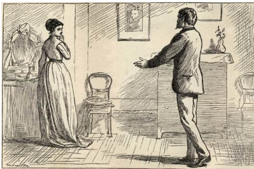
Shewing how reconciliation was made.

"Dearest Emily, I am so glad to come to you," said the husband, walking up to his wife in their bed-room, and taking her in his arms.