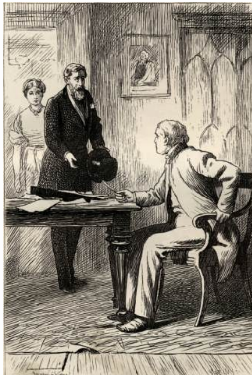
At St. Diddulph's.