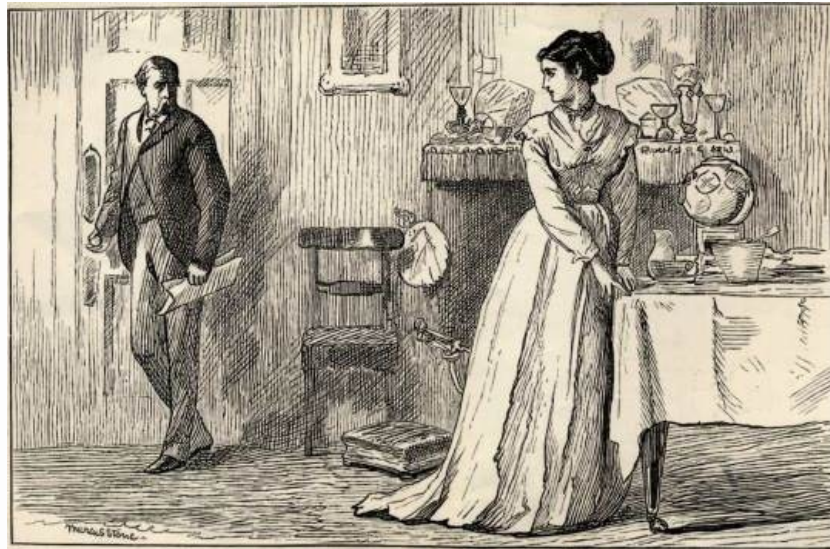
Shewing how wrath began.

a word of the things that were alleged against him. "But still, for all that, it is true," the husband had said. "I have no doubt that you think so," the wife had replied. "Men do believe evil of one another, very often. But you must excuse me if I say that I think you are mistaken. I have known Colonel Osborne much longer than you have done, Louis, and papa has always had the highest opinion of him." Then Mr. Trevelyan had become very angry, and had spoken those words which he could not recall. As he walked to and fro among his books down-stairs, he almost felt that he ought to beg his wife's pardon. He knew his wife well enough to be sure that she would not forgive him unless he did so. He would do so, he thought, but not exactly now. A moment would come in which it might be easier than at present. He would be able to assure her when he went up to dress for dinner, that he had meant no harm. They were going out to dine at the house of a lady of rank, the Countess Dowager of Milborough, a lady standing high in the world's esteem, of whom his wife stood a little in awe; and he calculated that this feeling, if it did not make his task easy would yet take from it some of its difficulty. Emily would be, not exactly cowed, by the prospect of Lady Milborough's dinner, but perhaps a little reduced from her usual self-assertion. He would say a word to her when he was dressing, assuring her that he had not intended to animadvert in the slightest degree upon her own conduct.