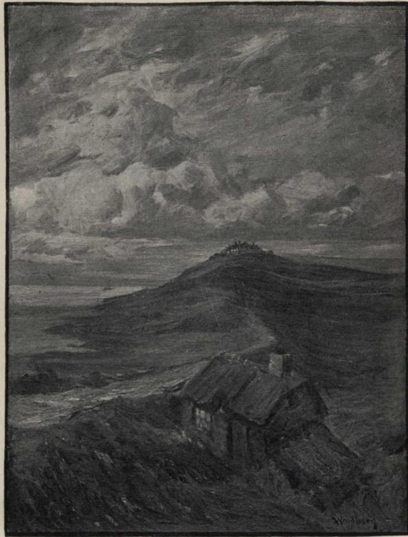
ALONG THE DIKE