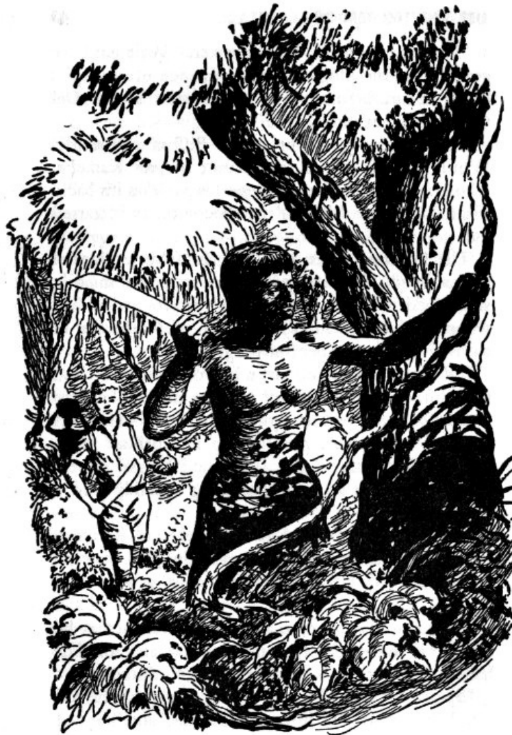
Kamuka cleared the branches with hard, expert slashes

Glistening between the tree branches were the largest, thickest spider webs that Biff had ever seen. There were multitudes of them, forming what at first glance seemed an impassible barrier.