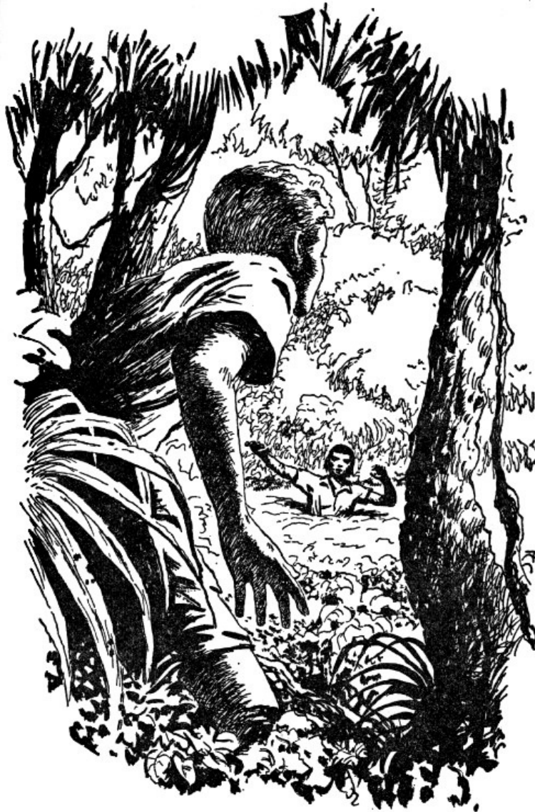
Biff felt the soft bank giving way beneath him

Biff couldn't wrench those branches loose from their trunks in time to save Kamuka. In fact, to push anything out from the bank looked like a hopeless plan. The best way to help would be by a pull straight up. Biff realized that, when he saw Kamuka look up toward the lowest bough, six feet or more above his head.