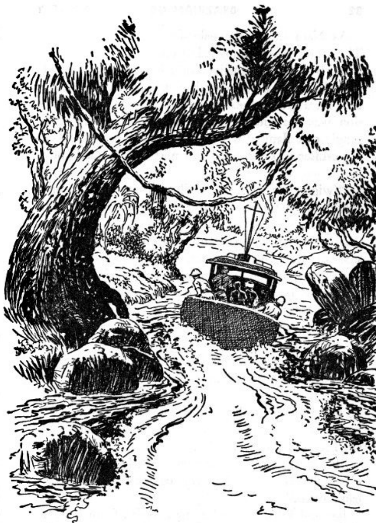
The Xanadu thrummed upriver

As Nara spoke, the palm-fringed island vanished. The whole sky had opened in one tremendous downpour. Biff couldn't believe that it was only rain. He thought for the moment that the Xanadu had come beneath a tremendous waterfall. Adding to the illusion was the sudden rise of steam from the heated jungle that flanked the channel. Instantly, the speeding cruiser was shrouded in a mist that swelled above it.