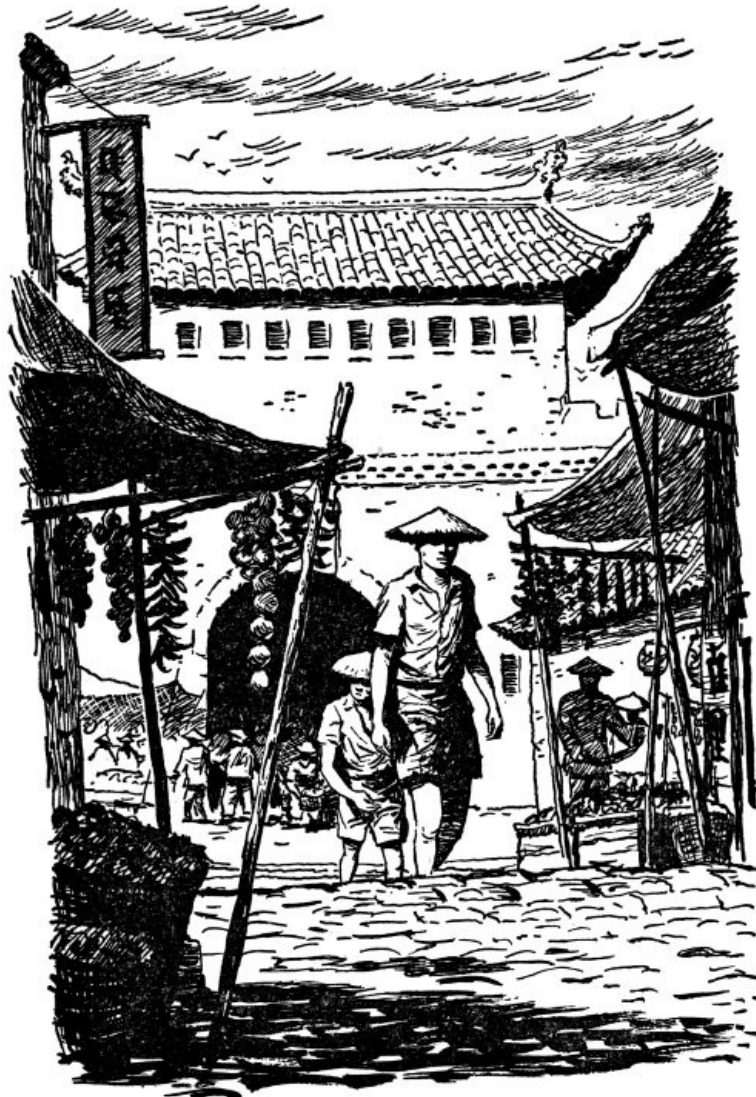
The boys passed booths selling everything from hot soups to shiny silks