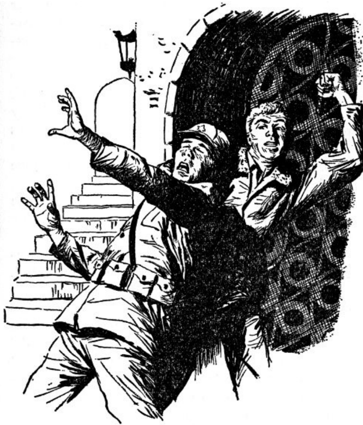
He grabbed the guard by the collar and lifted him by one hand into the room

"He says that paper with 'K' on it is signal. Either tonight, when clock makes twelve strikes, or tomorrow night at same time, attempt will be made to rescue him and us."