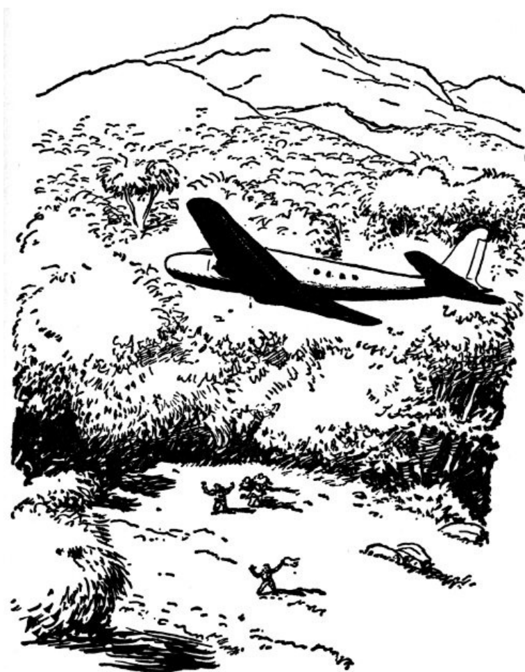
The plane winged in on the prayers of the group

Muscles turned to the anxiously waiting group. "Let's hope I get through. I can't repeat my signal more than once. It may be picked up by the enemy." He grinned at them. "Well, here goes." Muscles held the mike close to his mouth. "There's gold in these hyar hills...." He waited ten seconds. "Repeating.... There's gold in these hyar hills."