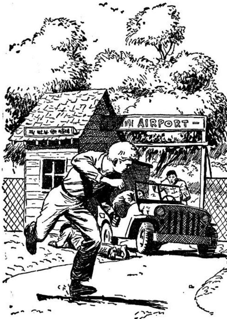
He ran back toward the terminal building

There would be no more trouble with those three, Biff said to himself. Not right away, at any rate. The boy continued toward the terminal building at a rapid walk. He didn't run, no need to, and if he did, he might attract attention. He might be stopped. Explanations would be demanded. The gate-keeper might come up and describe what had happened.