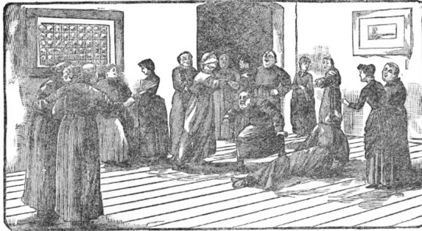
FESTIVITIES IN A PARSONAGE.

Immediately one of the ladies placed her nicely perfumed handkerchief over the eyes of her priest, took him by the hand, led him to an angle of the room, and having pushed him gently with her delicate hand, said: "Mr. Blindman! Let everyone flee! Woe to him who is caught!"