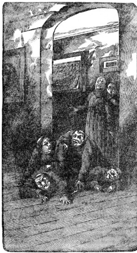
FALL OF THE "HOLY FATHERS."

No words can describe my feelings of shame when I saw, almost every day, some performance of this kind going on, under the name of Christian humility. In vain, I tried to silence the voice of my intelligence, which was crying to me, day and night, that this was a mere diabolical caricature of the humility of Christ. Striving to silence my untamed reason by telling it that it had no right to speak and argue and criticise, within the holy walls of the monastery. It, nevertheless, spoke louder, day after day, telling me that such acts of humility were a mockery. In vain, I said to myself, "Chiniquy, thou art not come here to philosophize on this and that, but to sanctify thyself by becoming like a corpse, which has no preconceived ideas, no acquired store of knowledge, no rule of common sense to guide you! Poor, wretched, sinful Chiniquy, thou art here to save thyself by admiring every idea of the holy rules of your superiors, and to obey every word of their lips!"