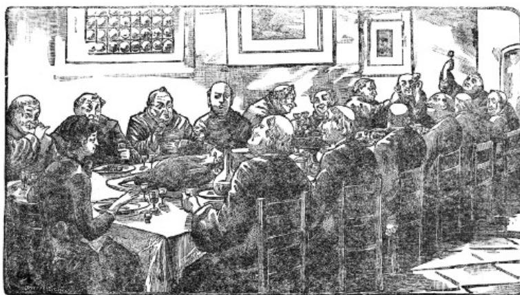
GRAND DINNER OF THE PRIESTS.