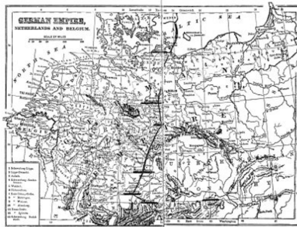
GERMAN EMPIRE, NETHERLANDS AND BELGIUM.

The Emperor Ferdinand II. now placed Maximilian of Germany and the ferocious General Tilly at the head of the army of the Catholic League, to attack the city of Prague.