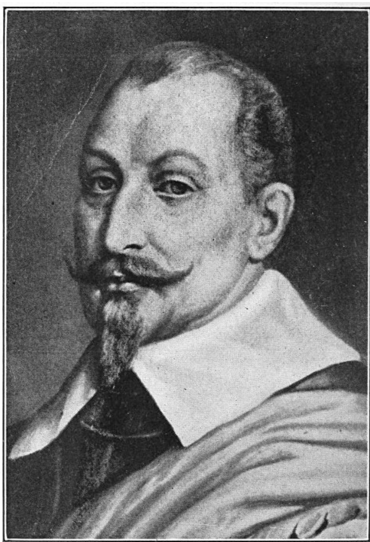
GUSTAVUS ADOLPHUS II.

*** START OF THE PROJECT GUTENBERG EBOOK HISTORY OF THE LIFE OF GUSTAVUS ADOLPHUS II., THE HERO-GENERAL OF THE REFORMATION ***