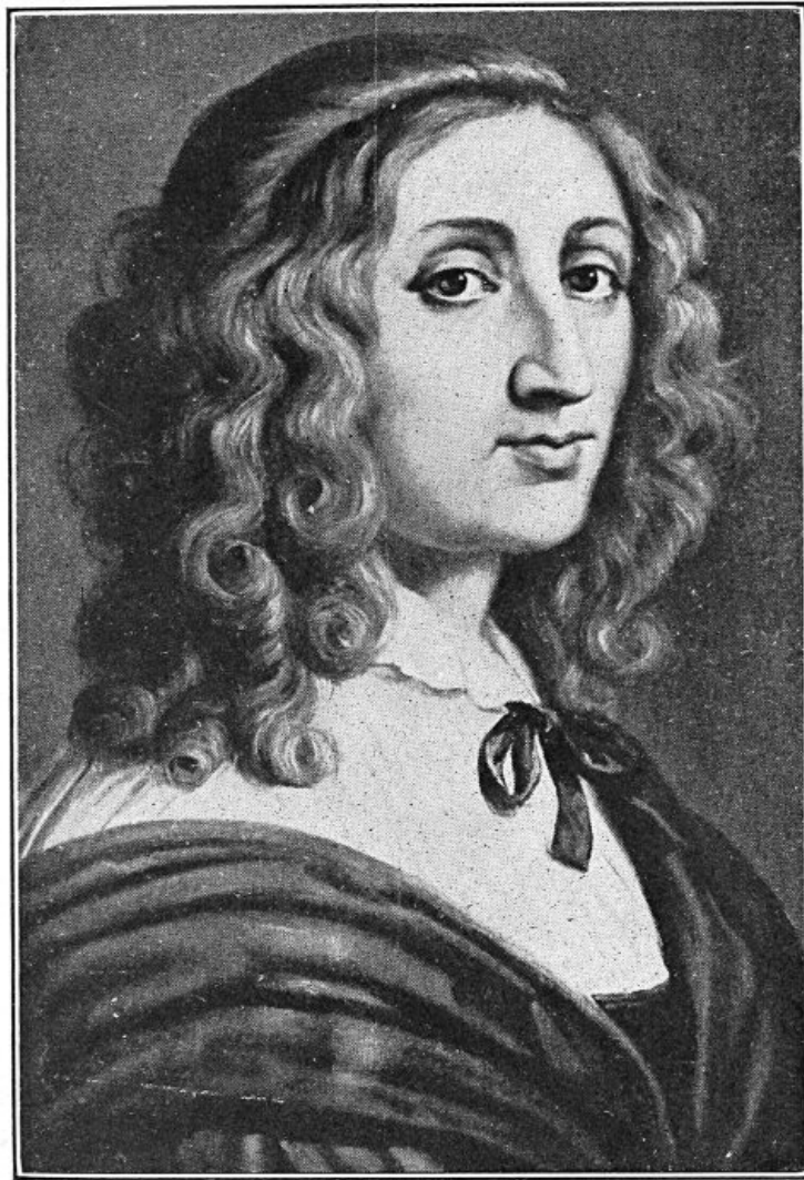
CHRISTINA, Daughter of Gustavus Adolphus II.