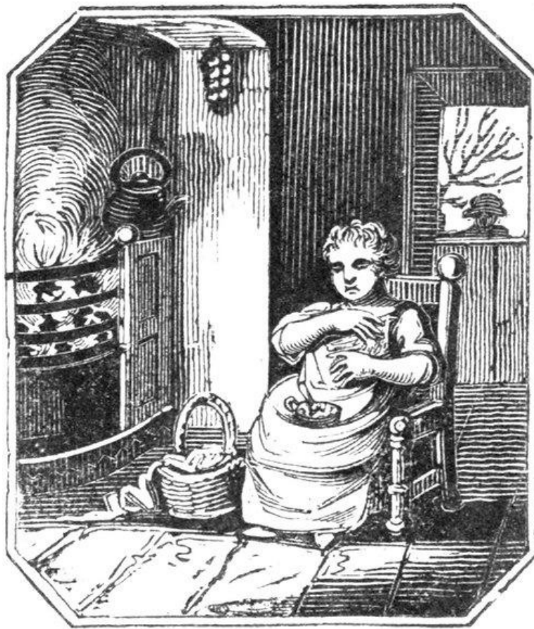
Nursing the chicken.

At last my young mistress could keep me no longer, her father insisted that I should either be killed, or go with the rest of my species, and setting open the door they fairly hunted me out.