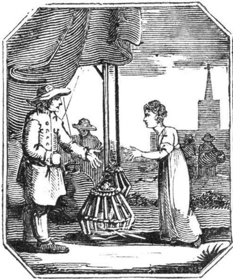
Purchasing the hen.

I accordingly had a good supper and went to rest in a clay hovel, very different to what I had been accustomed to, but I thought how much worse my situation might have been; my fatigue and anxiety soon put me into a sound sleep, from which I was awakened, by being violently laid hold of. When I opened my eyes, I saw a great ugly man who held a sack and lanthorn in his hand. Oh! oh! mistress hen, I did not expect such luck, you will be a nice addition to my stock: he then threw me into the sack, which he flung over his shoulder, and walked a considerable way; this mode of carrying me, together with my sore bruises, produced such violent pain, that I grew quite insensible; when I recovered, I found myself confined with several of my fellow creatures in a large hen-coop, they told me they had all been stolen by the same man, some had been torn from their children, husbands, or parents. I asked for what purpose. What! can you be ignorant that he intends taking us to market to be killed, and eaten? At the thought of being exposed in my present miserable condition to be handled by the multitude, my blood froze in my veins.