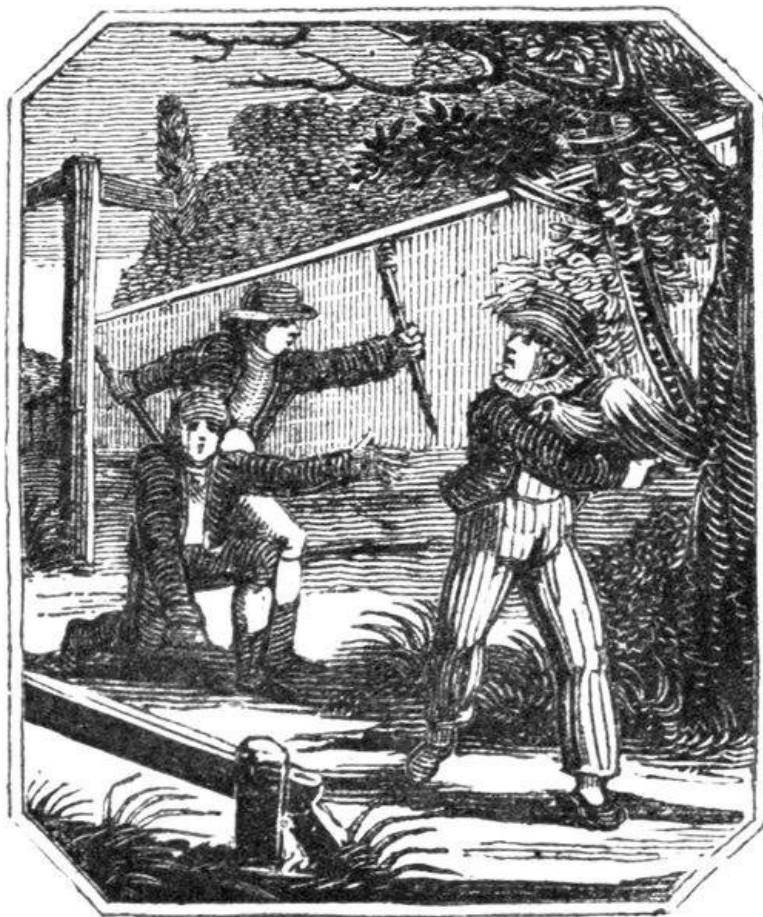
Taking away the hen.

My master was a pupil in a very large school; the house in which he boarded, accommodated twelve more, but none so kind as himself; many slight injuries I received, but I considered how much worse my lot had been, and felicitated myself accordingly; but too soon I felt the most acute torments.