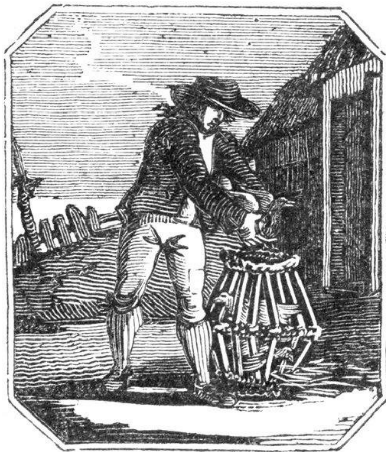
Putting the hen into the basket.

Numbers came to inquire our price, I was lifted up, and pricked, and pulled about, to see whether I was fat; but the distress I had of late been in, had made me very thin, I was therefore always thrown down again, with this observation, why, what a bag of bones this hussey is, I would not have her if you would give her to me.