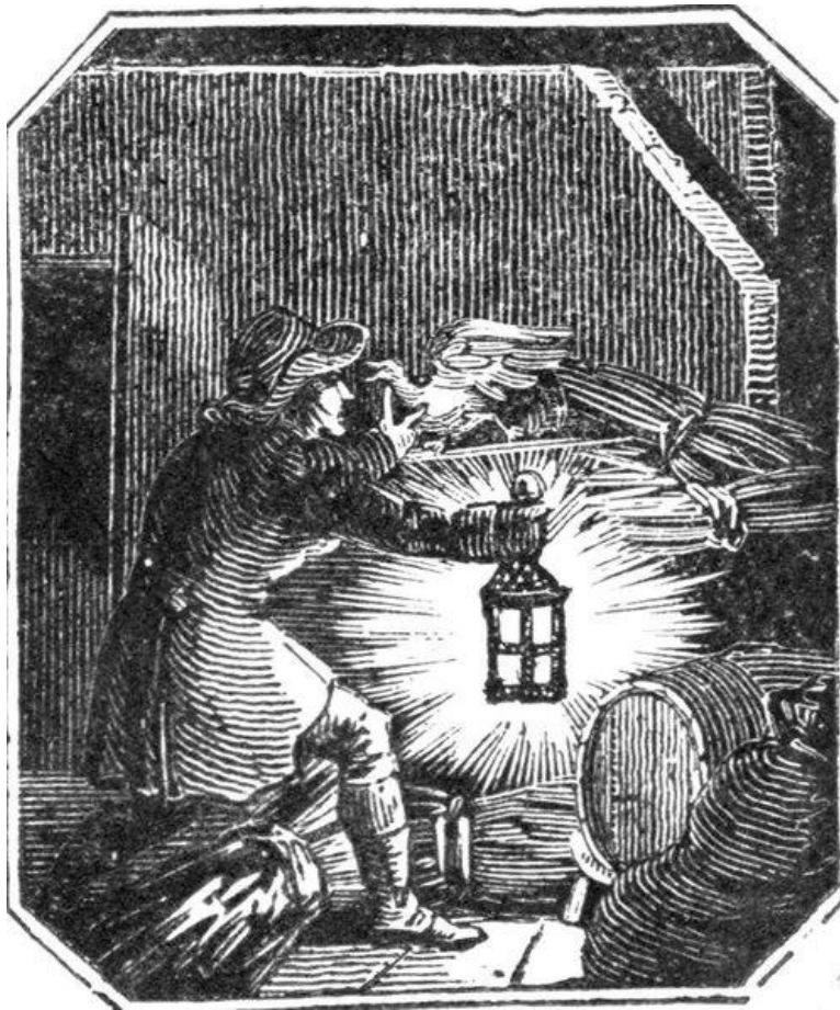
Stealing the hen.

I passed about a week in this coop; we were well fed, as our keeper wished to make us fat. One night we were alarmed with a tremendous noise, I turned to inquire the cause, when I saw the brave white cock trembling like a chick: oh! said he, give yourselves over now, nothing can save us from destruction, we shall all be devoured; no sooner had he said this, but a large fox entered; Oh! my children, how can I describe the horrors of the bloody scene which followed, even at this distance of time, the recollection draws tears from my eyes; I alone remained of all my companions; he was advancing to me, when some noise in the yard frightened him, and he ran away, leaving me more dead than alive with fright.