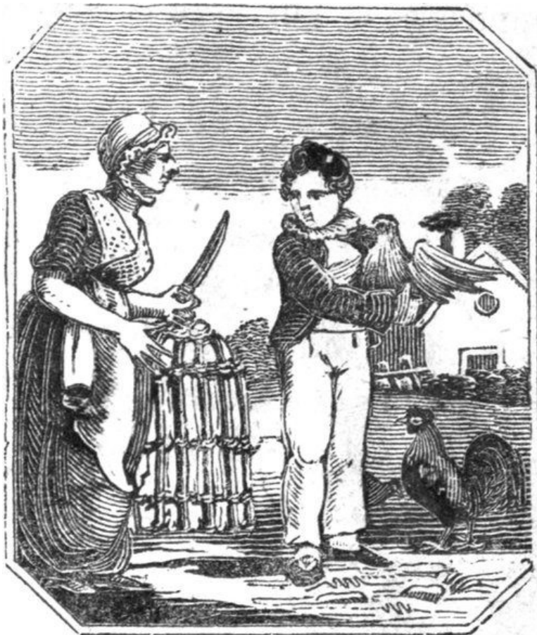
Saving the hen.

determined to place me here, with this worthy farmer, till his return.