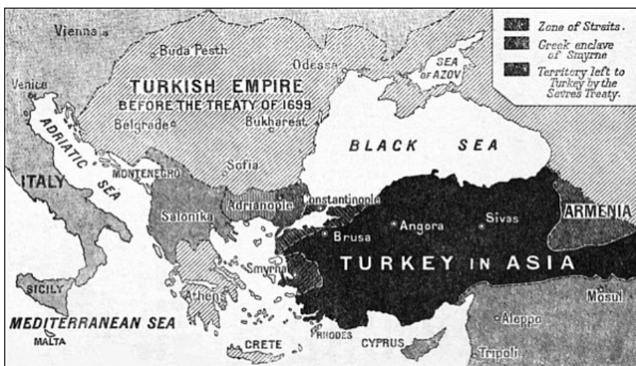
SCHEMATIC MAP OF THE TERRITORIES LOST BY TURKEY SINCE 1699, AND OF THE TERRITORIES LEFT TO TURKEY BY THE SÈVRES TREATY.